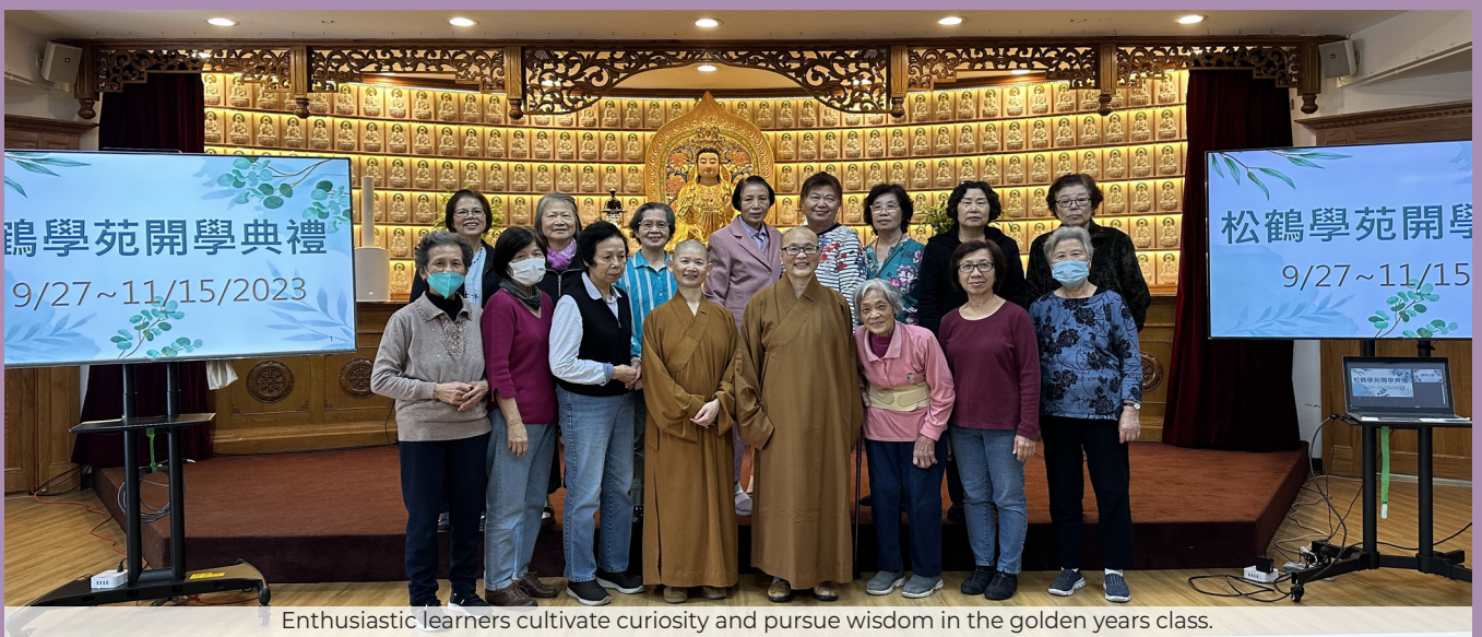
Enthusiastic learners cultivate curiosity and pursue wisdom in the golden years class.