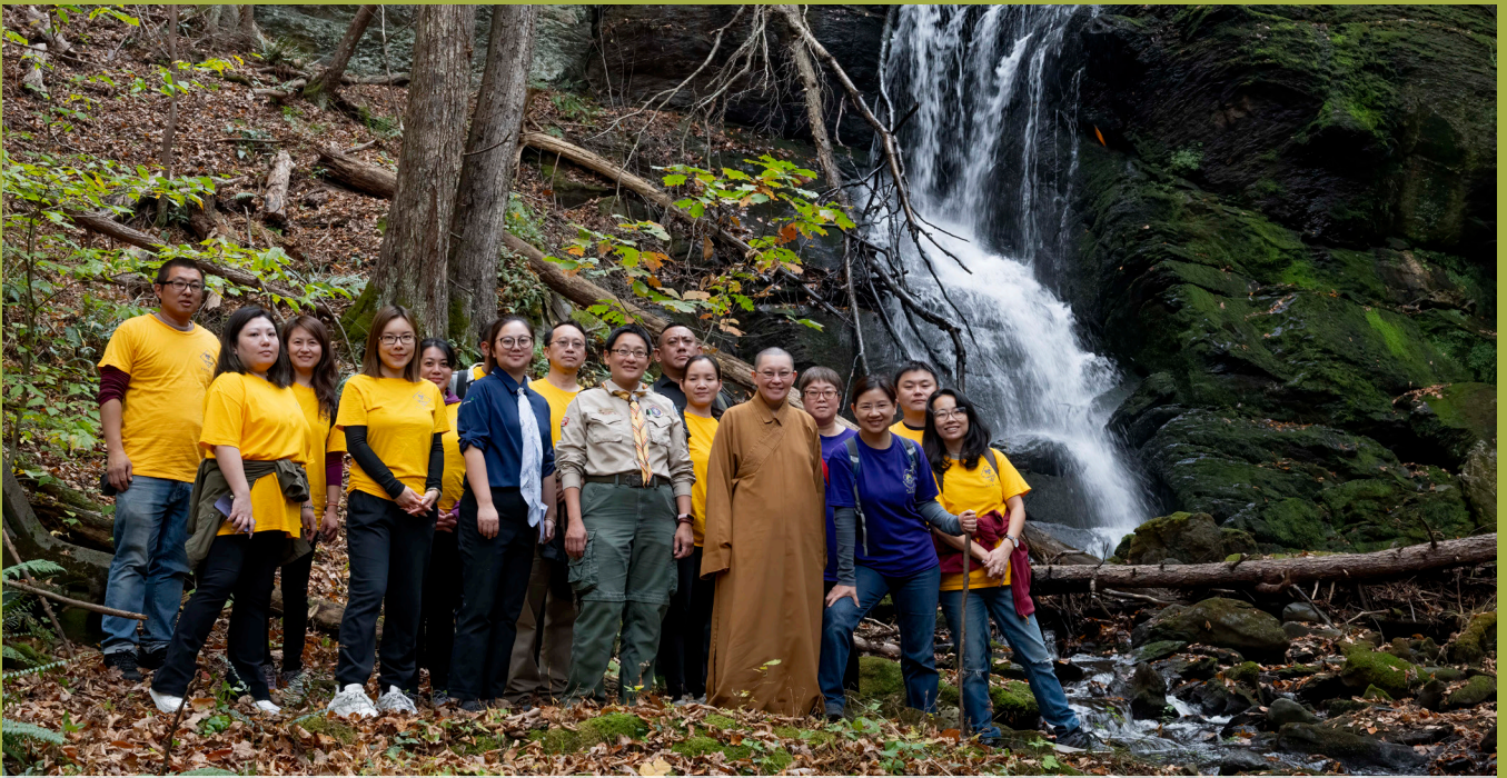
This camp aims to teach Buddhism and meditation through activities like hiking, Sutra Calligraphy, and eating.