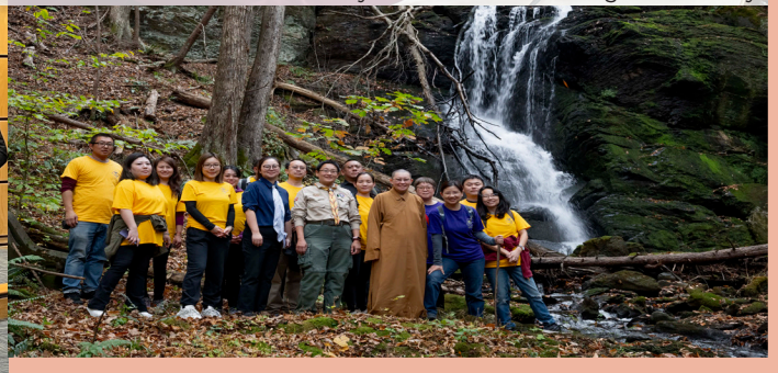
Summer Camp is held, aiming to bring peace to Children's hearts.