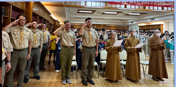
The Venerables and Scout troops leaders take an oath.