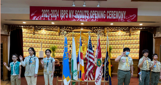
Delegates from Scout troops take an oath.