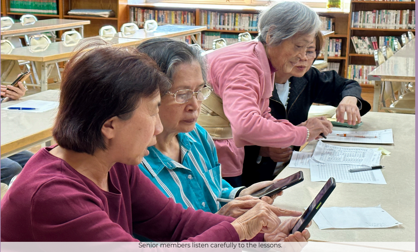
Senior members listen carefully to the lessons.