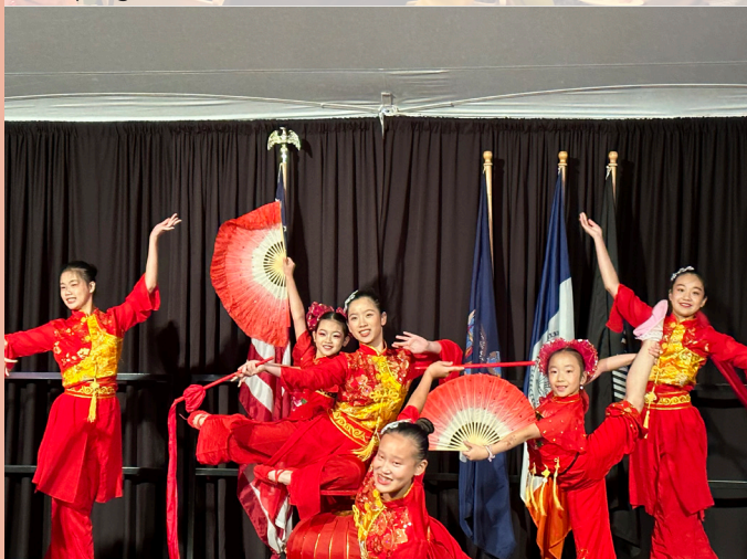
Dancers give a wonderful Chinese Dance performance.