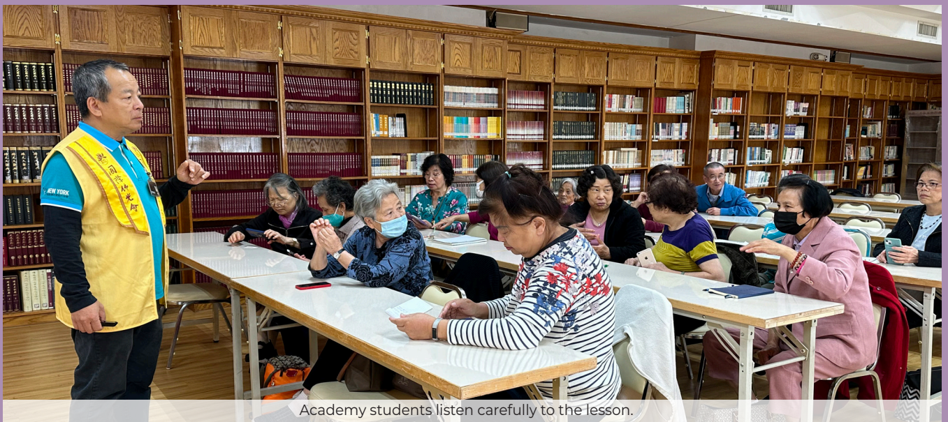
Academy students listen carefully to the lesson.