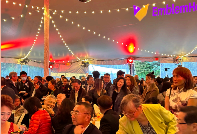
People gather at the Gracie Mansion to celebrate the Festival.