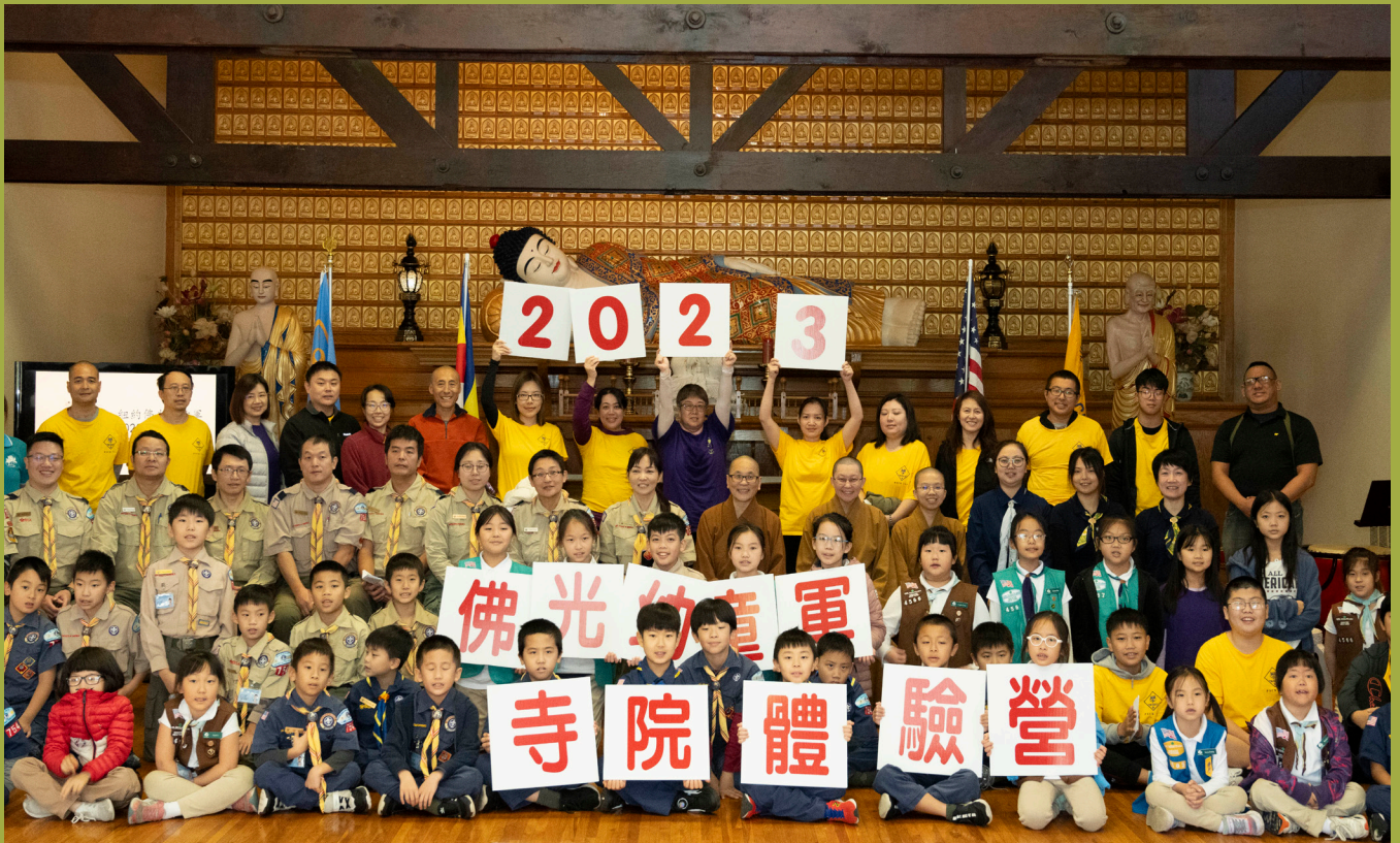
A hundred scouts, parents, and distinguished guests assemble in Deer Park located at Upstate New York for the Summer Camp.