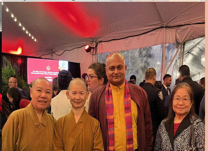
FGS NY Representatives gather to attend the joyful celebration.

New York City Mayor Eric Adams held a special celebration event at Gracie Mansion, the official residence of the Mayor of New York City, on September 28th, just before the Mid-Autumn Festival. Once again, FGS NY was invited to attend. The event was attended by hundreds of guests from various backgrounds.