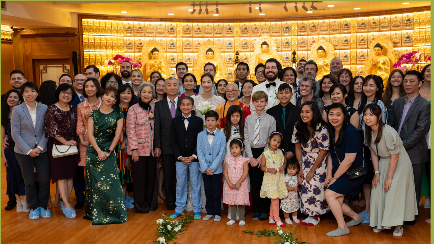
On September 23rd, a Buddhist-infused wedding was held at Fo Guang Shan New York Temple.