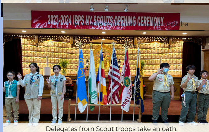
Delegates from Scout troops take an oath.