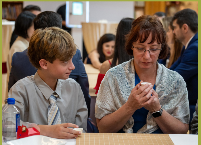
The groom's family and friends enjoy tea together.