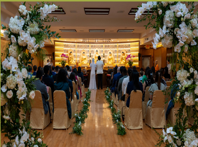
The newlyweds joyfully unite in marriage amidst blessings.