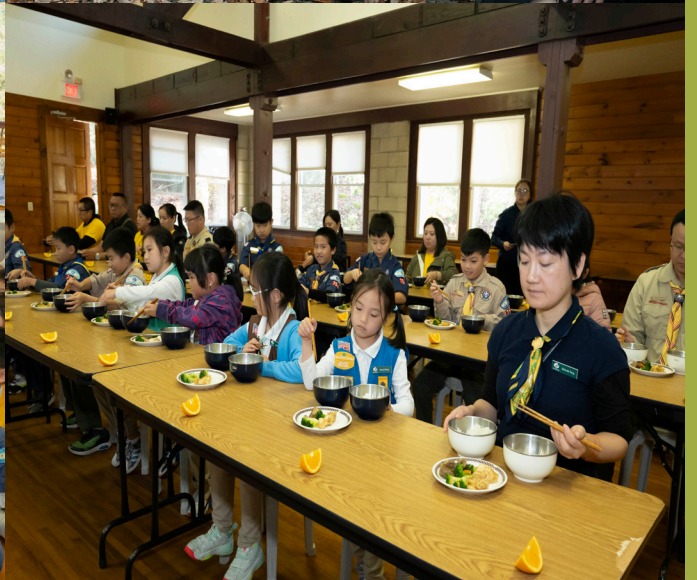
Kids learn how to practice “three acts of goodness” – do good deeds, speak good words, and think good thoughts in daily life.