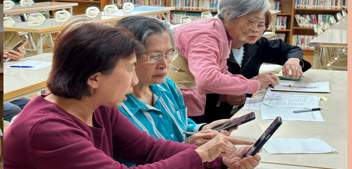
Senior members listen carefully to the lessons at Songhe Academy.