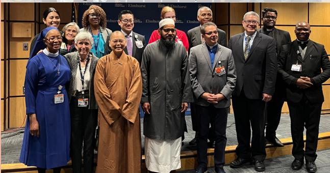
BLIA engages in community care initiatives at Spiritual Week.