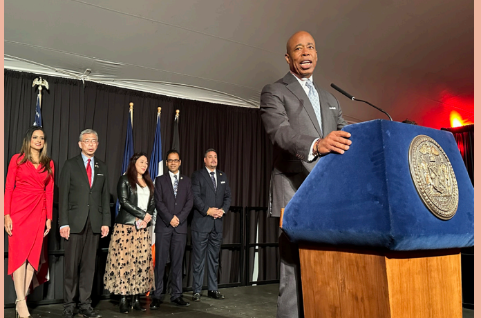
Mayor Eric Adams gives a speech on cultural preservation.