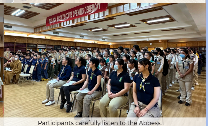
Participants carefully listen to the Abbess.