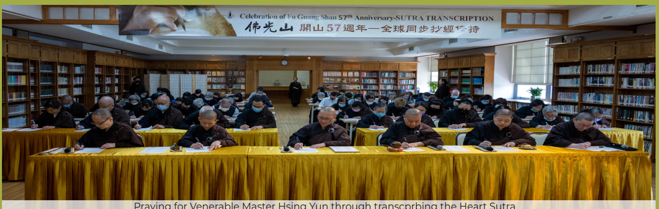
Praying for Venerable Master Hsing Yun through transcribing the Heart Sutra