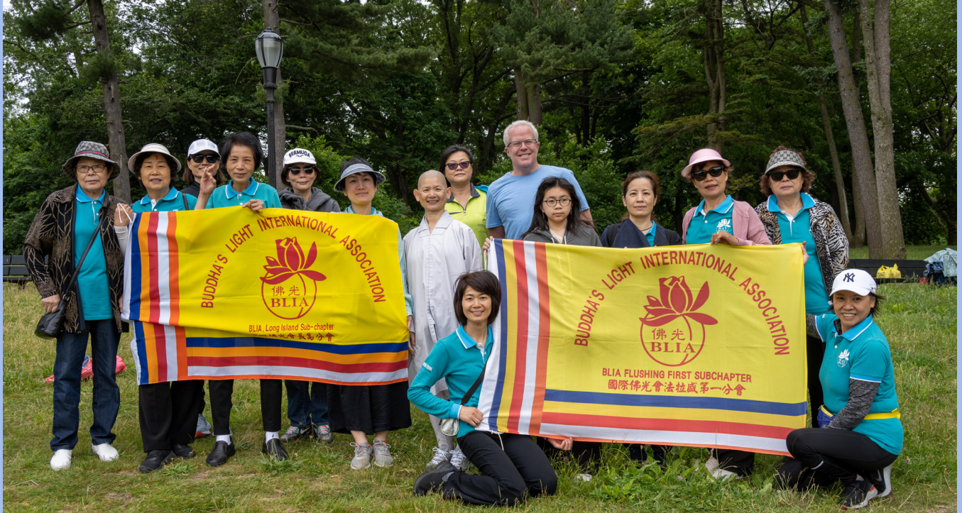
BLIA NY's Flushing 1st Branch and Flushing 2nd Branch holding the “Global VEGRUN” at Kissena Park

To promote vegetarianism and environmental awareness, BLIA NY Chapter, Long Island Subchapter, Flushing 1st subchapter and Flushing 2nd Subchapter, held a pre-warm-up event for the “Global VEGRUN” on May 13th and June 3rd. The event took place at Kissena Park in Queens and included activities such as walking, light exercises, and meditation.