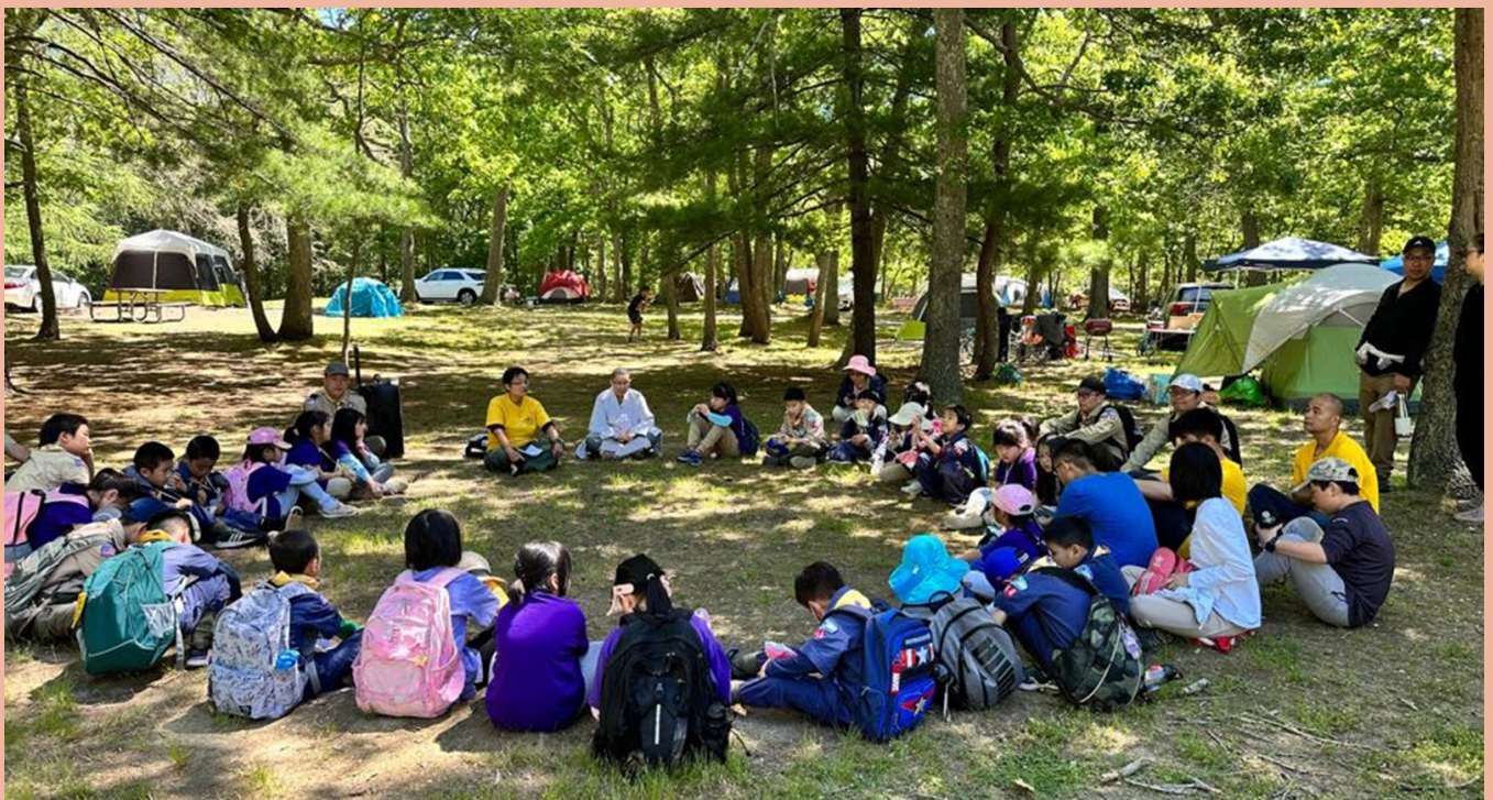
Scouts gathering together to listen to the class

During the campfire evening, the scouts performed a theatrical program. Venerable Youlin praised eight scouts who successfully completed their tasks. She emphasized that the egg represents life, urging everyone to respect life and others and to develop an attitude and sense of responsibility in their actions.