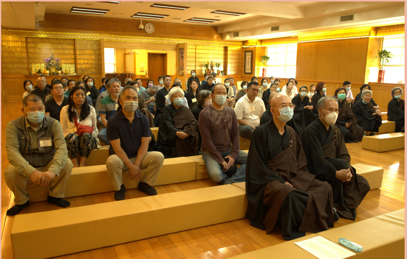
Attendants gathering at FGSNY to celebrate Father's Day