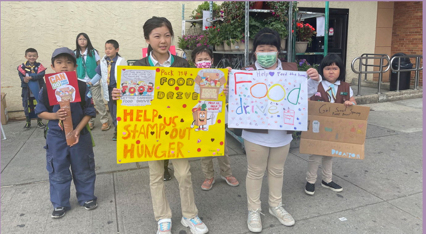
Children holding up the prepared posters and approached passersby to collect food donations

As the founder of Fo Guang Shan, Venerable Master Hsing Yun, once said, “Involvement leads to depth, dedication leads to excellence, the ordinary leads to extraordinariness, and practice leads to proficiency.” The charity food drive event exemplifies the practice of the “Three Acts of Goodness” principles advocated by Venerable Master Hsing Yun in daily life.