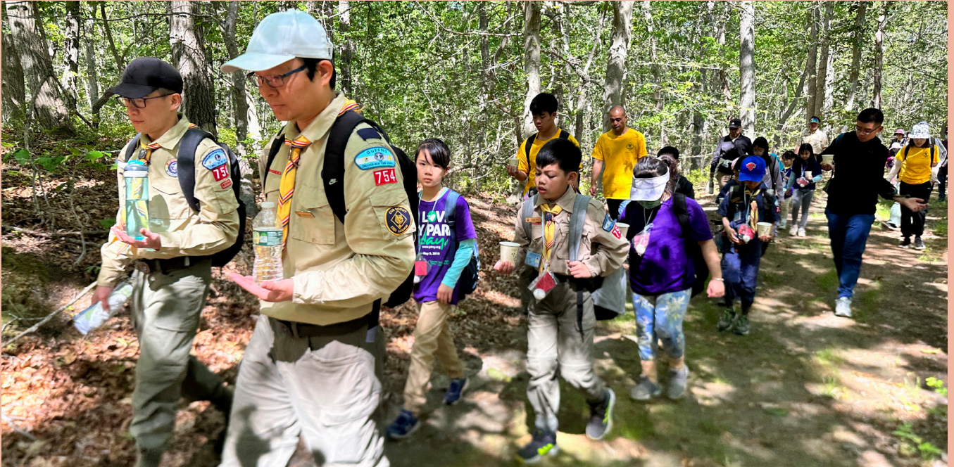
Scouts exploring Wildwood State Park

Over a hundred members including the scouts, parents, and volunteers embarked on a three-day, two-night camping trip to Wildwood State Park on May 27th. The purpose of this annual event was to learn basic wilderness survival skills such as fire building, knot tying, and hiking while promoting the concept of 'Leave No Trace' and environmental consciousness.