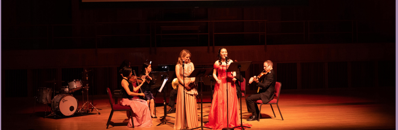
Renowned international musicians telling Venerable Master Hsing Yun's Story through Music