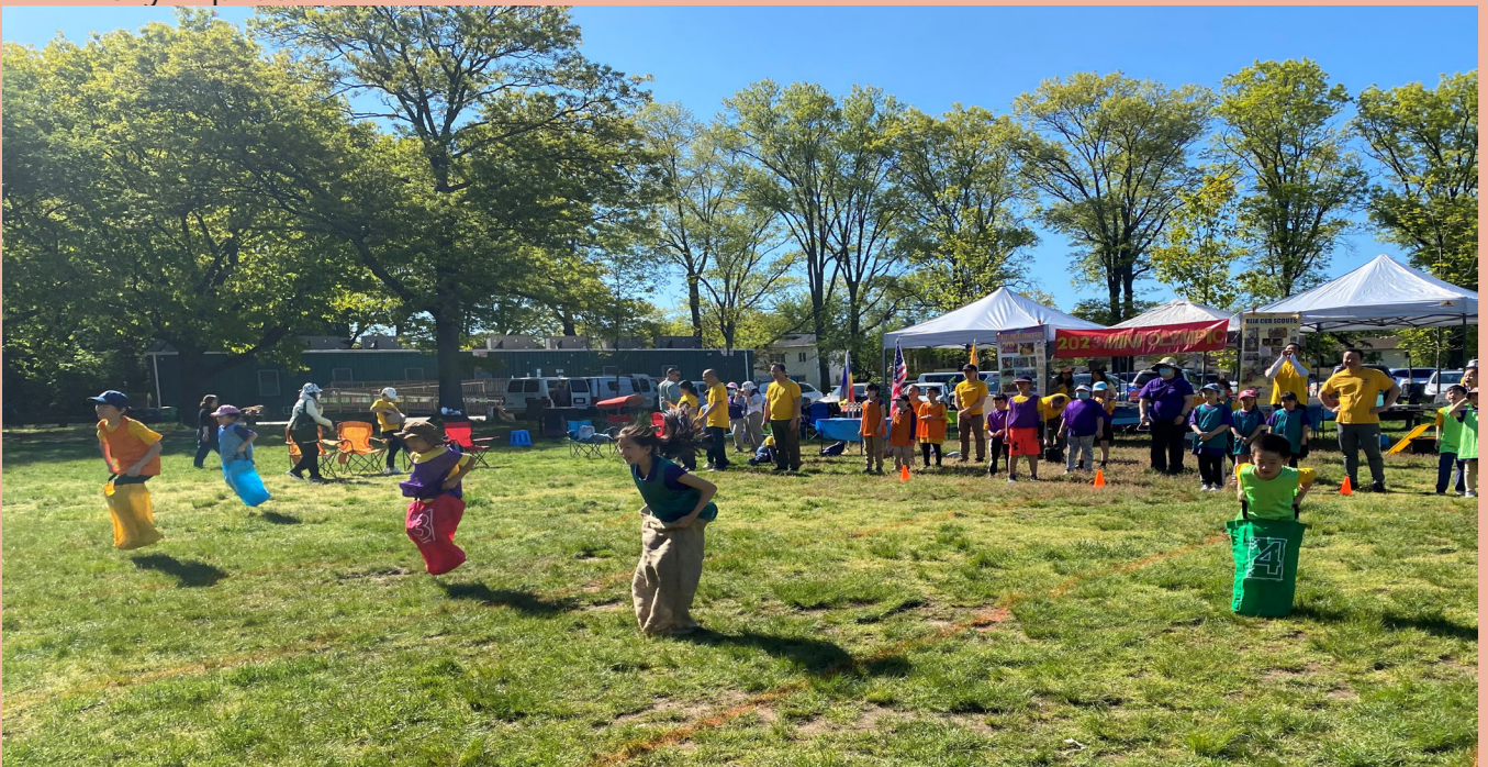
Scouts in the bag playing the "Kangaroo Jump"

On the occasion of the Lixia solar term in 2023, nearly 80 enthusiastic leaders, scouts, and parents from the New York Fo Guang Youth Scouts gathered at Alley Pond Park for the annual New York Fo Guang Pack 754 Mini Olympics.