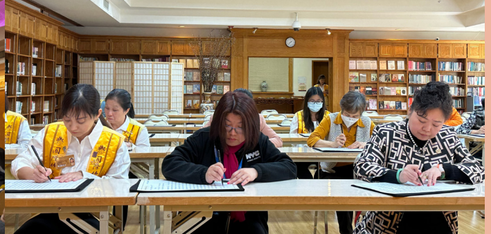
Transcription of the Heart Sutra on NYC Day of Prayer