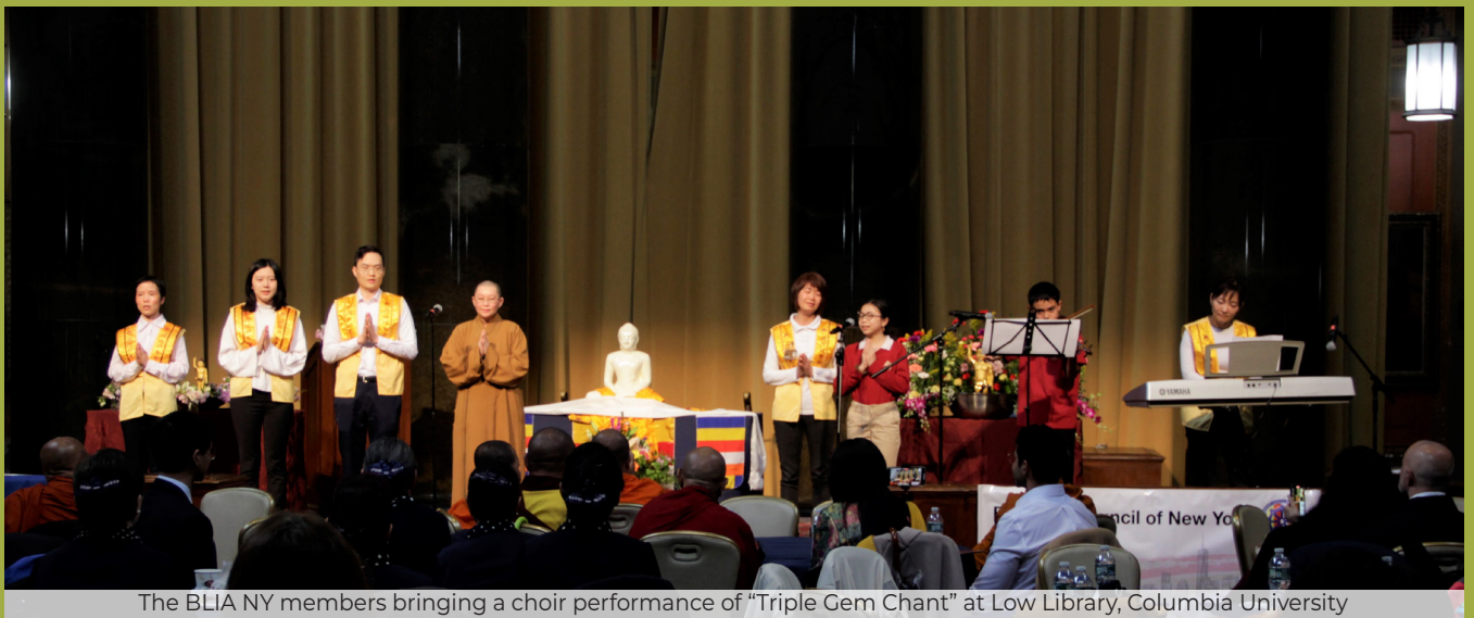
The BLIA NY members bringing a choir performance of "Triple Gem Chant" at Low Library, Columbia University

Venerable Youlin expressed, "The enthusiasm of everyone cannot be dampened by heavy rain. I am delighted to see young people from various Buddhist organizations participating in the event. It signifies the continuity of Buddhism. If we do not differentiate between "you" and "me," there is hope for Buddhist unity." This event emphasized the core values of Buddhism, which are compassion, wisdom, and inner peace.