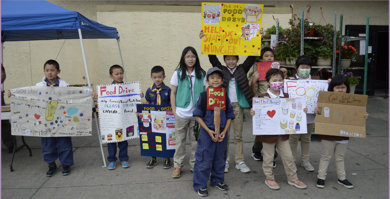
Children gathering and conducting the food drive event

The Fo Guang Shan Buddhist Temple of New York Scout Troop hosted a “Scout Charity Food Drive” event on June 3rd and 4th. A group of 20 leaders, scouts, and parents gathered at Windsor Park for the event. Despite their young age, the scouts demonstrated their commitment to kindness, embodying the spirit of the Fo Guang Shan Scouts’ “Three Acts of Goodness” principles and fostering a sense of faith. Through the food drive, they aimed to spread love and compassion.