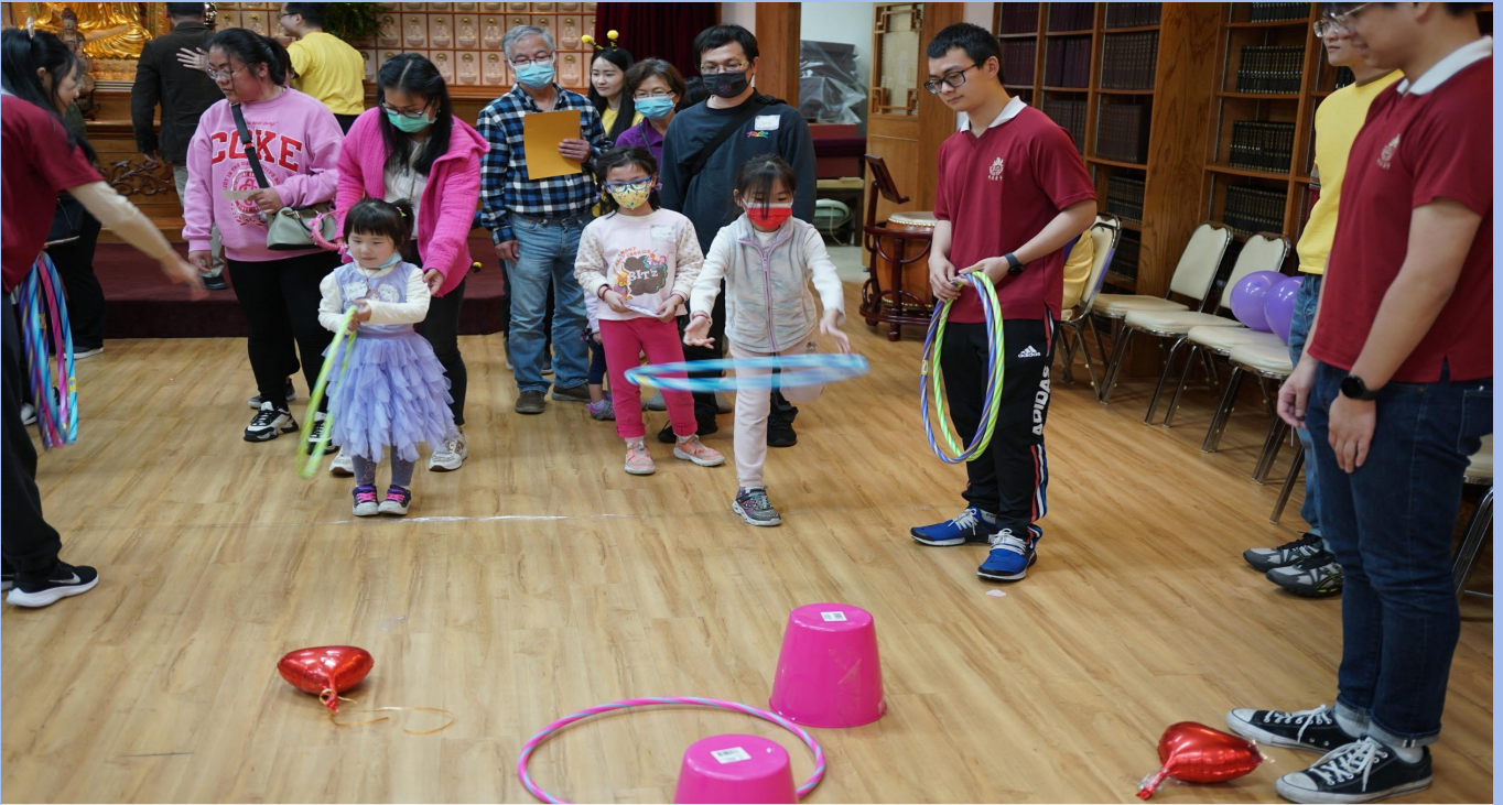
Children playing games and gaining knowledge of the Three Jewels