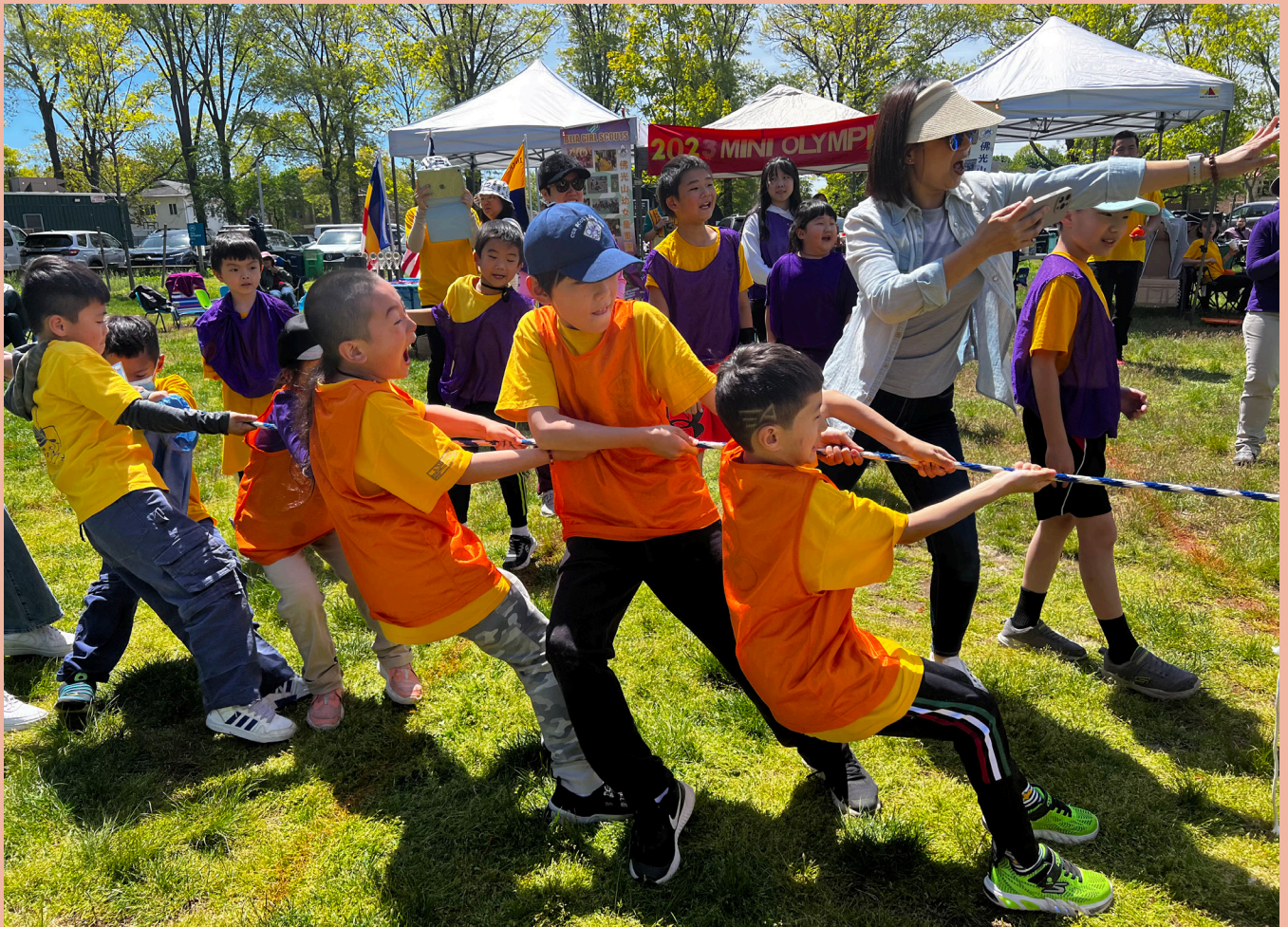
Children are participating in a tug-of-war competition