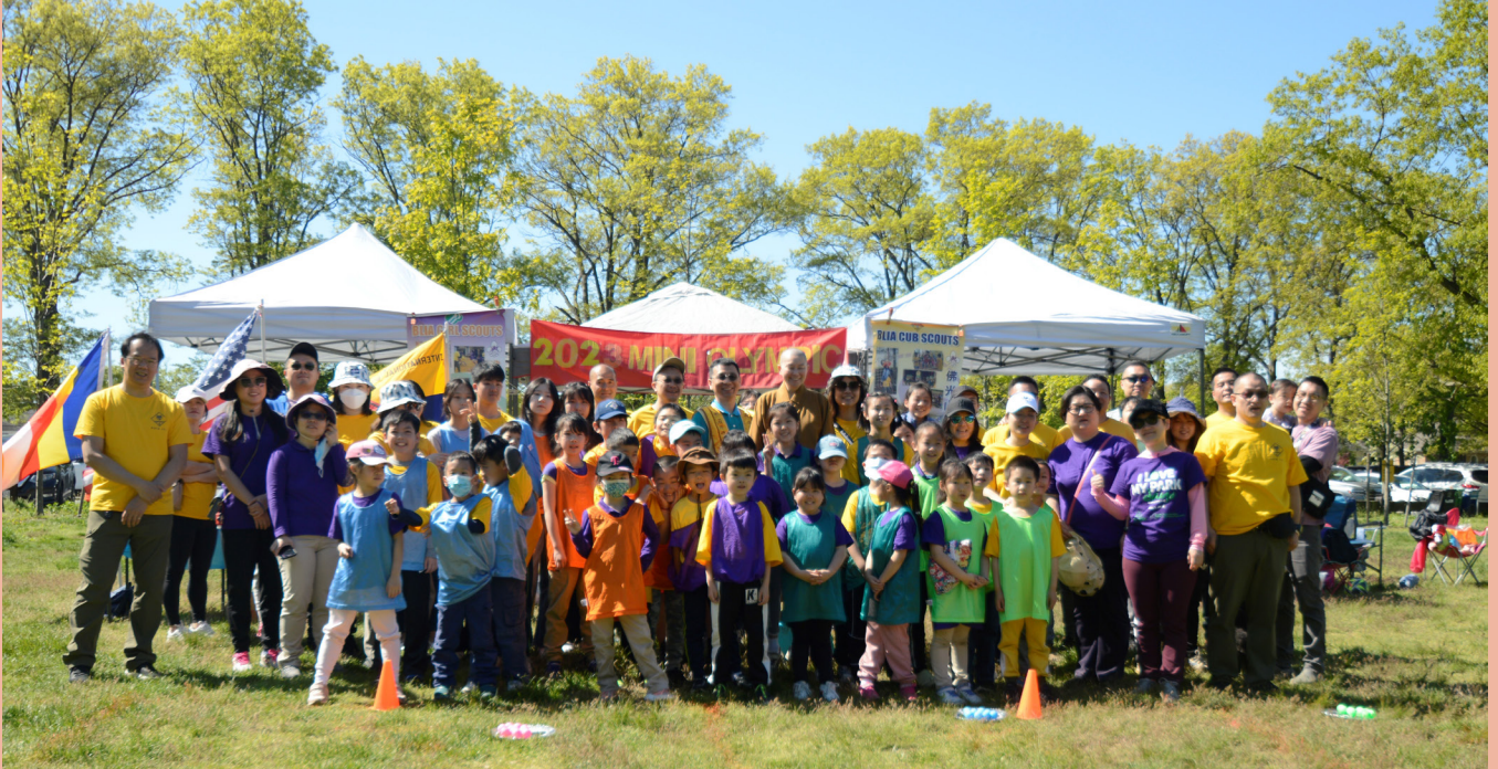
BLIA members, scouts, and parents gathering at Alley Pond Park for the annual New York Fo Guang Pack 754 Mini Olympics

On the occasion of the Lixia solar term in 2023, nearly 80 enthusiastic leaders, scouts, and parents from the New York Fo Guang Youth Scouts gathered at Alley Pond Park for the annual New York Fo Guang Pack 754 Mini Olympics.