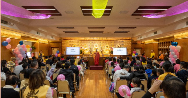
FGSNY holding Baby Blessing Ceremony