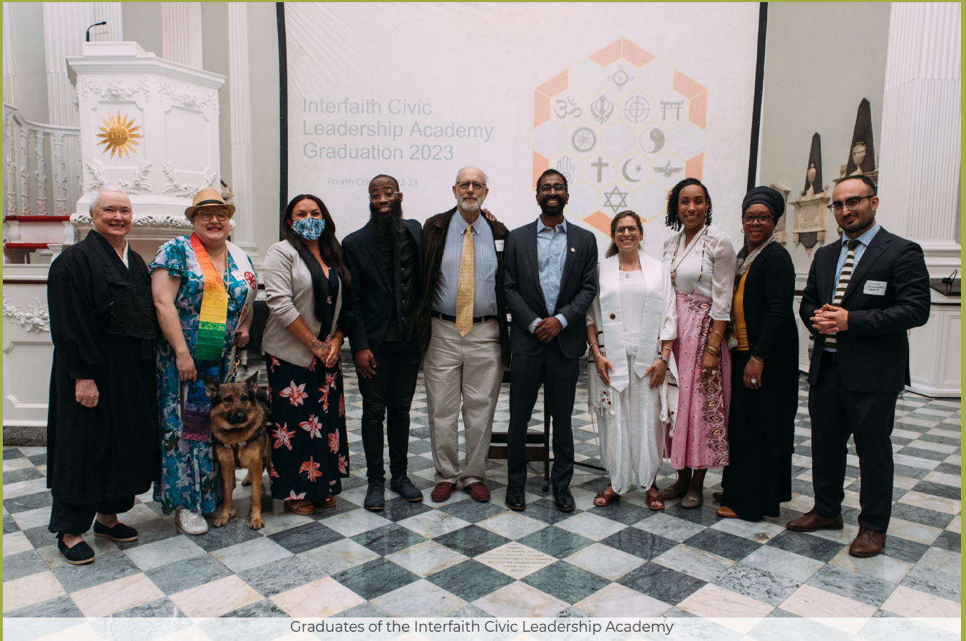
Graduates of the Interfaith Civic Leadership Academy

Graduates of the academy expressed gratitude to the Interfaith Center of New York for offering this program, believing that through their learnings at the academy, they have gained a better understanding of how to use the power of faith to serve their communities. Representatives from different sectors shared their thoughts on the power of faith and New York's multiculturalism. The event emphasized the irreplaceable role of faith in civil society, emphasizing its power and aspiring for attendees to use this power to make New York a better place.