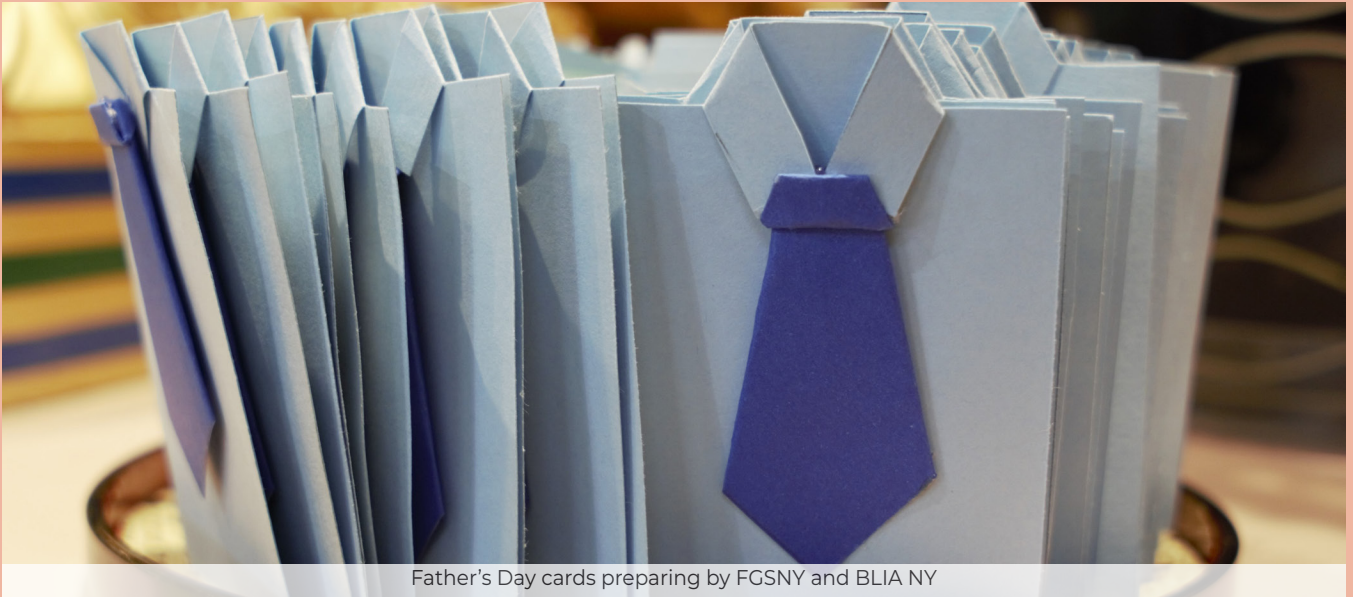
Father's Day cards preparing by FGSNY and BLIA NY