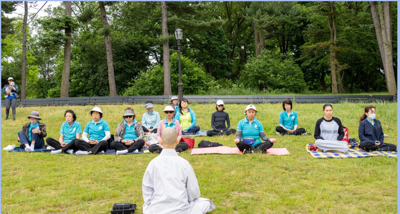
Members sitting on the grass conducting meditation

With purified minds, the members walked around the beautiful lakeside scenery, following the path around the lake. Some preferred jogging, while others enjoyed walking. With mutual understanding and care, they made efforts to persevere and pursue the goal of using sports for charity. Following the principle of giving imparted by the founder of Fo Guang Shan, Venerable Master Hsing Yun, they exerted their strength together in the Vegerun charity run.