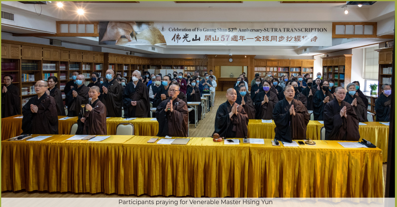
Participants praying for Venerable Master Hsing Yun