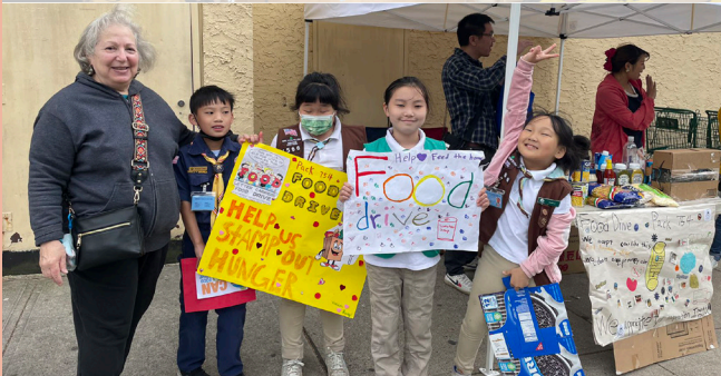
Scouts conducting food drive event