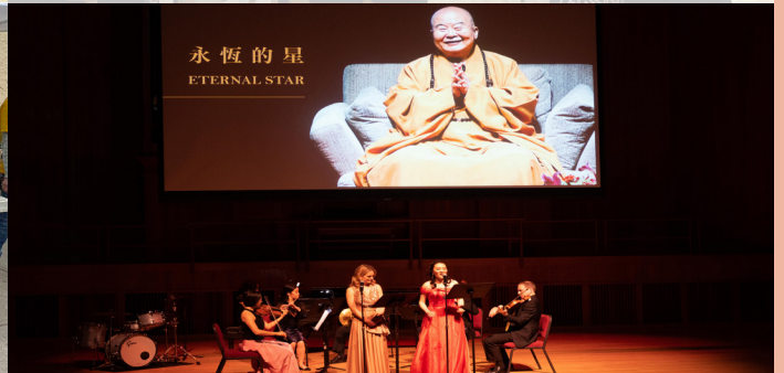
BLIA presenting Eternal Star Concert