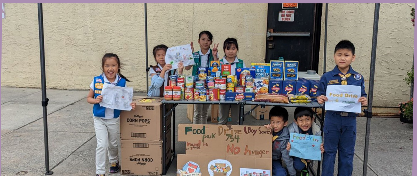
The table filling with an abundance of food

As the founder of Fo Guang Shan, Venerable Master Hsing Yun, once said, “Involvement leads to depth, dedication leads to excellence, the ordinary leads to extraordinariness, and practice leads to proficiency.” The charity food drive event exemplifies the practice of the “Three Acts of Goodness” principles advocated by Venerable Master Hsing Yun in daily life.