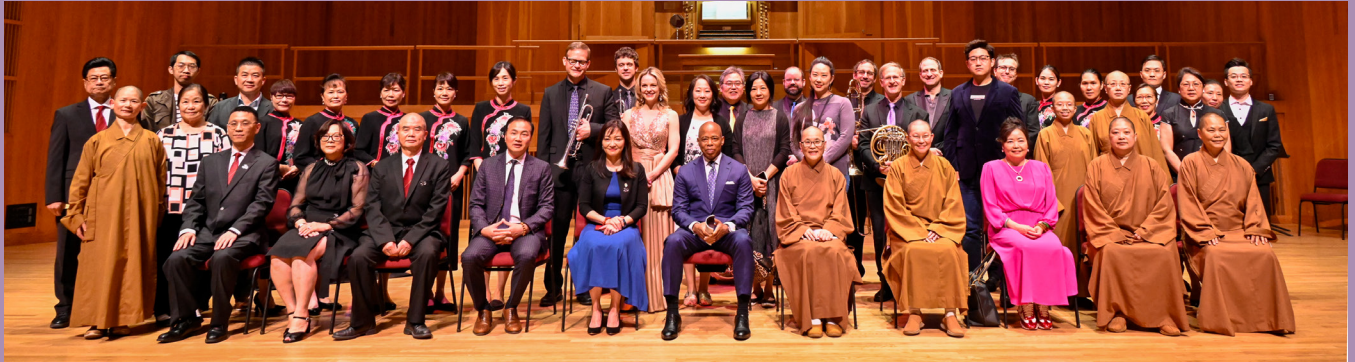
NYC Mayor Eric Adams taking photo with famous musicians and FGSNY, BLIA NY members

In commemoration of the founder of Fo Guang Shan, Venerable Master Hsing Yun, Fo Guang Shan Buddhist Temple of New York and the BLIA NY Chapter organized the “Eternal Star” charity concert on June 9. The event featured a joint performance by the New York Metropolitan Opera Orchestra and various music artists. Through the healing power of music, the concert paid tribute to Venerable Master Hsing Yun, making it a remarkable and awe-inspiring musical feast. Approximately 500 audiences attended this grand event.