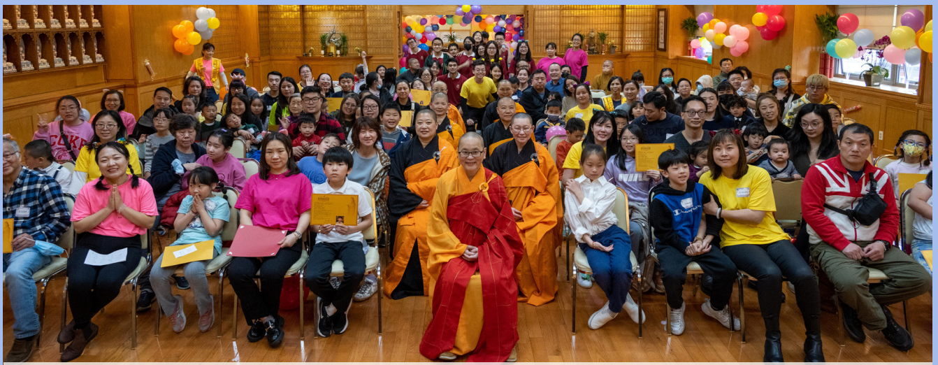
Children and parents bringing happiness and blessing to home