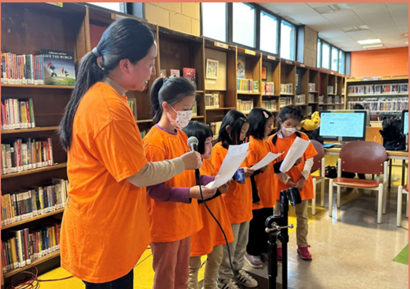
The teacher leads the second-grade children in a choric recitation of Venerable Master Hsing Yun's work