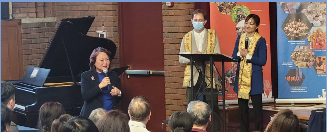
On March 8th, BLIA hosts a side event on March 8th, focusing on "Faith and Gender Equality: Empowering Women in a Post-

When Buddha attained enlightenment, his first words were "All beings have Buddha-nature, all are equal." Hence, equality is a fundamental tenet of Buddhism. Venerable Master Hsing Yun asserts that in his eyes, there are no distinctions of gender; respect prevails. Fo Guang Shan has long embraced gender equality, with bhikkhunis taking on significant roles like abbots in its temples around the world. Both Fo Guang Shan and BLIA exemplify the spirit of giving, equality, and empowerment worldwide, establishing schools in resource-scarce areas and consistently aiding women and children in need, enabling them to access education and opportunities.