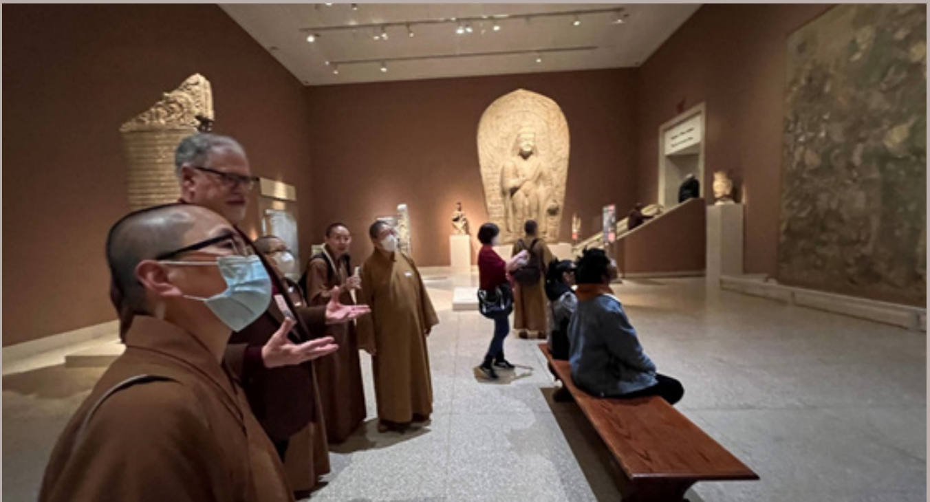
Bhikshunis attentively listen as volunteers explain the collection of Buddhist artifacts.