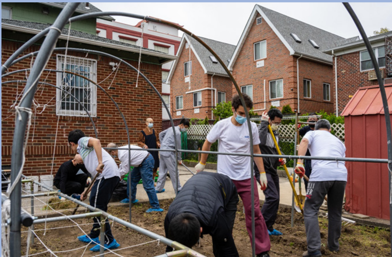
Attendees perform daily temple tasks

The participants expressed great joy and gratitude for being able to attend the precepts ceremony. They mentioned that the ceremony provided valuable learning and profound insights. They are committed to upholding the precepts and applying the teachings of Humanistic Buddhism in their daily lives.