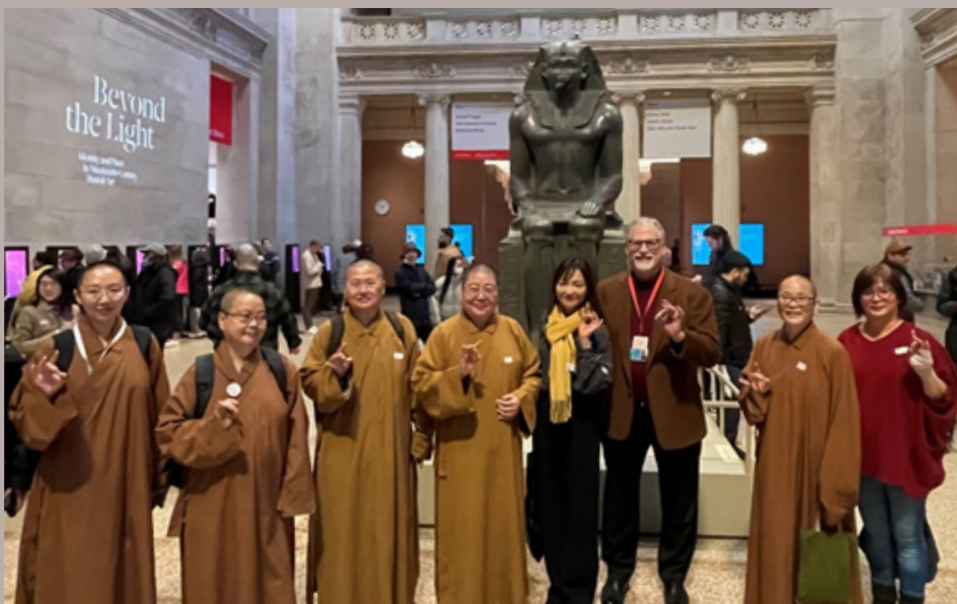
Bhikshunis from Fo Guang Shan and BLIA members visit the Metropolitan Museum of Art. Pandemic World.