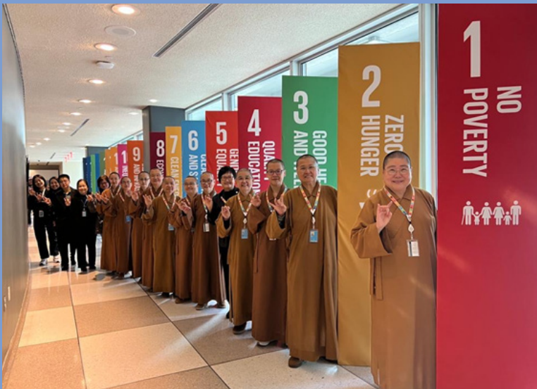
FGS and BLIA's efforts showcase that Humanistic Buddhism aligns with the United Nations' 17 Sustainable Development Goals.