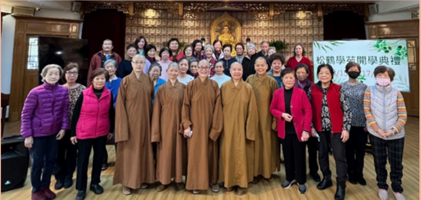
Songhe Academy teachers and students joyfully gather together

The First Opening Ceremony of Songhe Senior Academy at Fo Guang Shan Buddhist Temple of New York was held on March 15th with a total of 30 participants, mostly senior volunteers who serve at the temple for many years. The ten-week Songhe Senior Academy offers over 30 diverse courses, including tea Zen, smartphone use, health exercises, film-book discussion club, handicrafts, Tai Chi, spiritual cultivation, and special lectures.