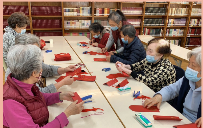
Making Red Lanterns