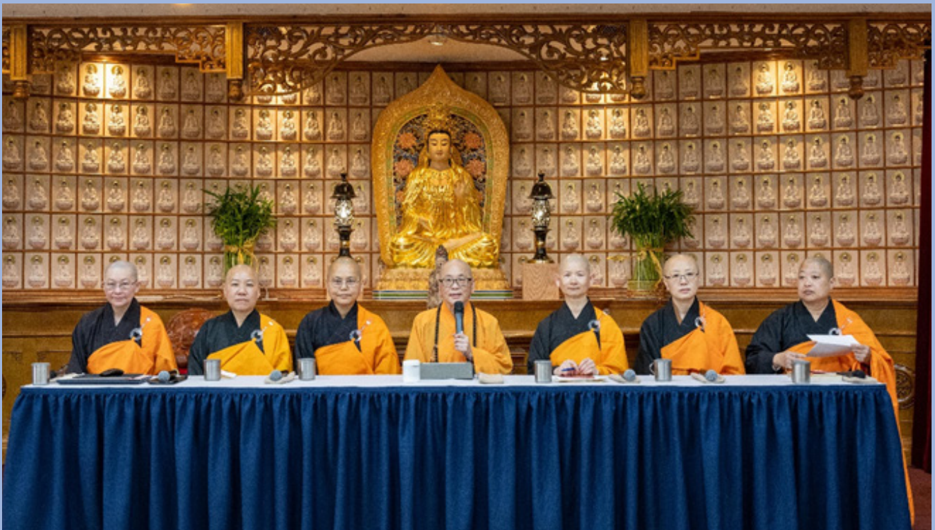
Venerables sharing their personal stories about their ordination and connection with the Venerable Master Hsing Yun