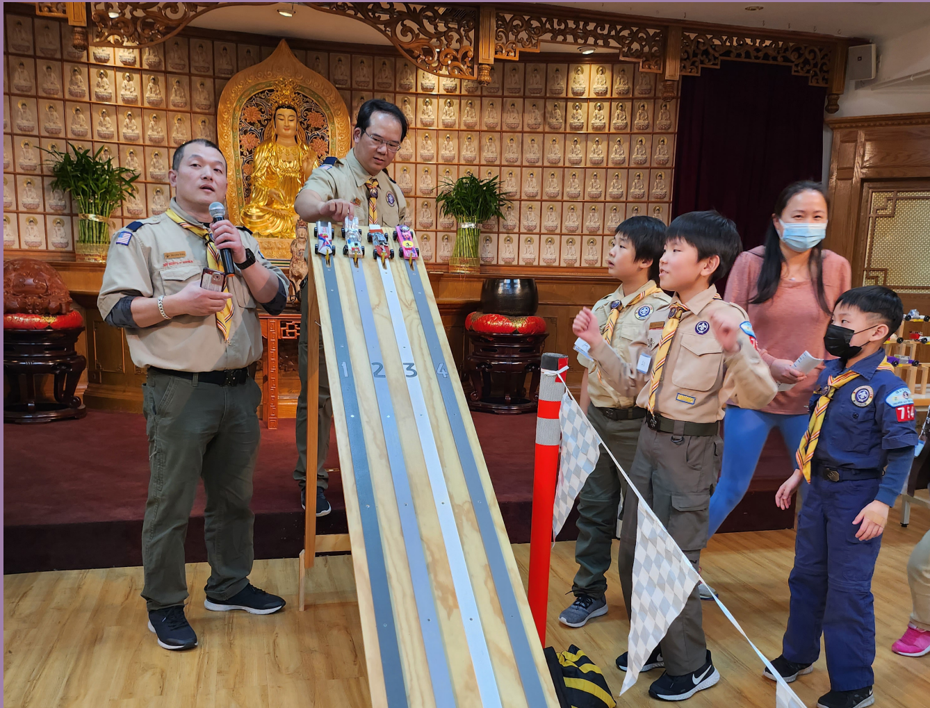
Cub Scouts bring their personally designed, crafted, and decorated racing cars to the temple