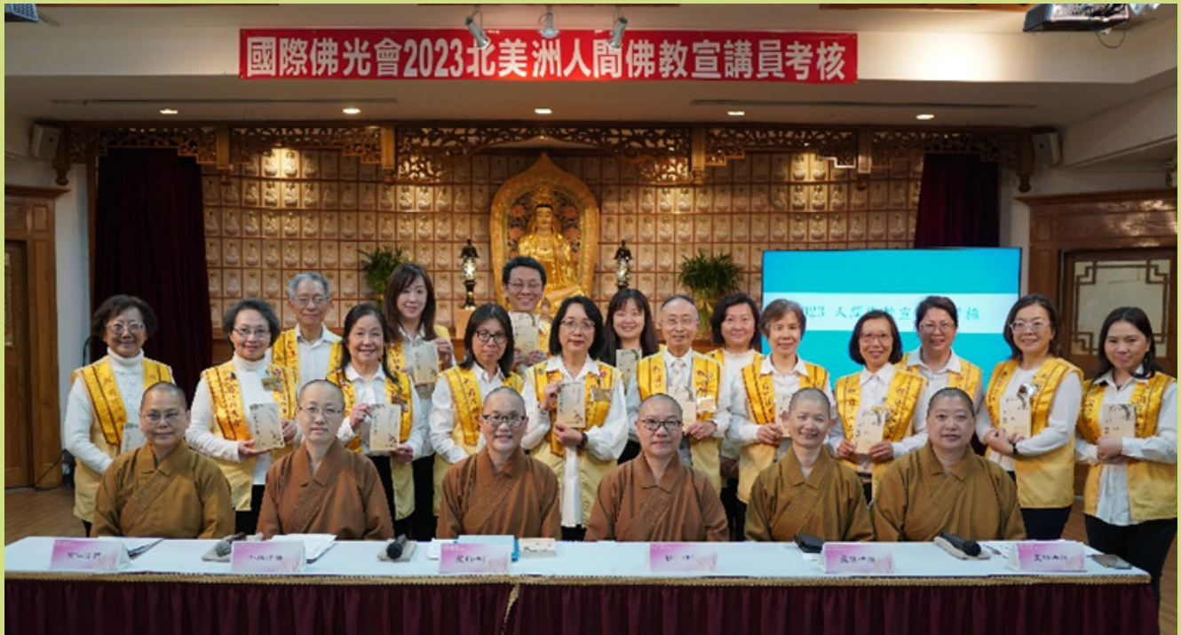
Venerables from BLIA NY, BLIA NJ, and six examinees gather together at Fo Guang Shan Buddhist Temple of New York to attend the assessment

On April 29th, BLIA World Headquarters held the "North America Humanistic Buddhism Speaker Assessment." Following the first round of training and the second round of interviews, synchronized physical assessments were conducted in 8 designated test areas in the United States and Canada. After rigorous evaluation by 40 Venerables, the first batch of 30 outstanding Humanistic Buddhism Speaker in North America has been selected, adding further momentum to the propagation of Humanistic Buddhism in the region.