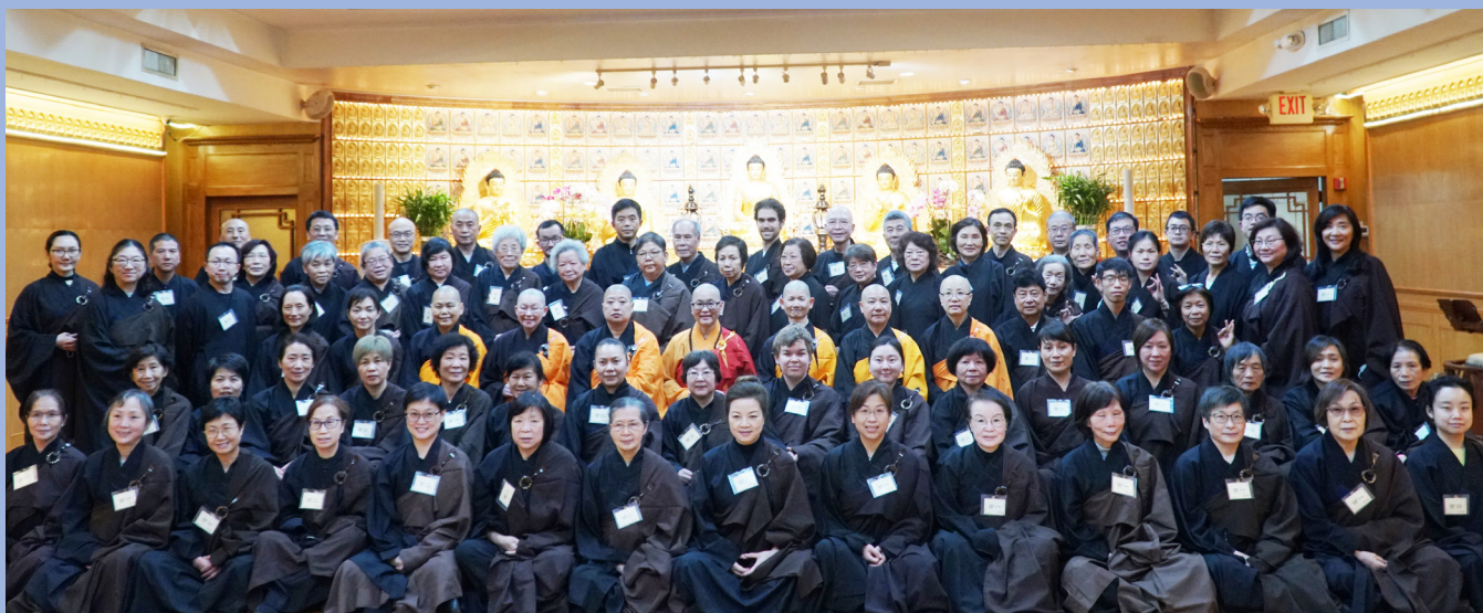
76 devotees from over North America sought to receive the Eight Precepts