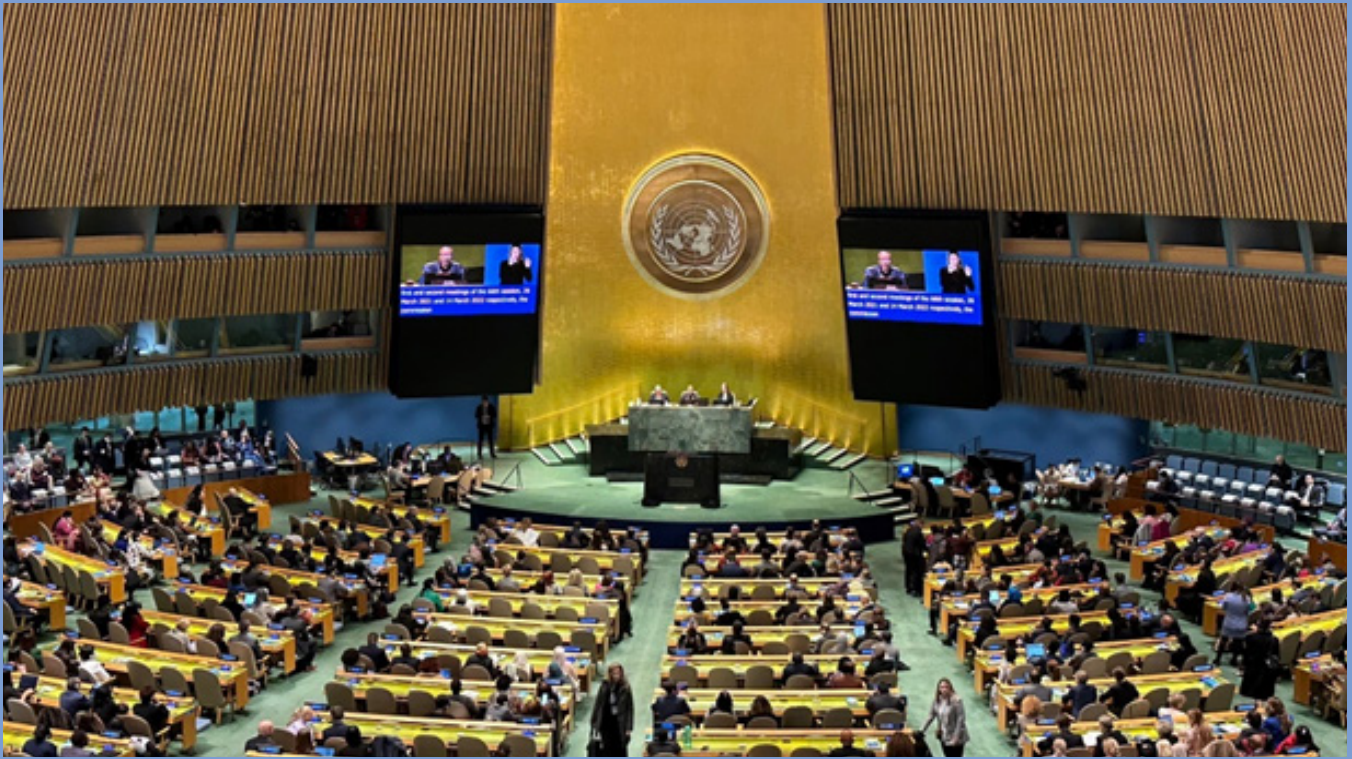
Leaders from over the world gather at UN Headquarters to discuss gender equality and the empowerment of all women and girls

On March 6th, the sixty-seventh session of the Commission on the Status of Women, CSW67, commenced at the UN Headquarters in New York, set to continue for 12 days. The conference's theme revolves around "Innovation and technological change, and education in the digital age for achieving gender equality and the empowerment of all women and girls." Fo Guang Shan and the BLIA had 25 monastic and lay representatives in attendance at the opening ceremony, marking the fifth consecutive participation since 2018. BLIA will also host a side event on March 8th, focusing on "Faith and Gender Equality: Empowering Women in a Post-Pandemic World."