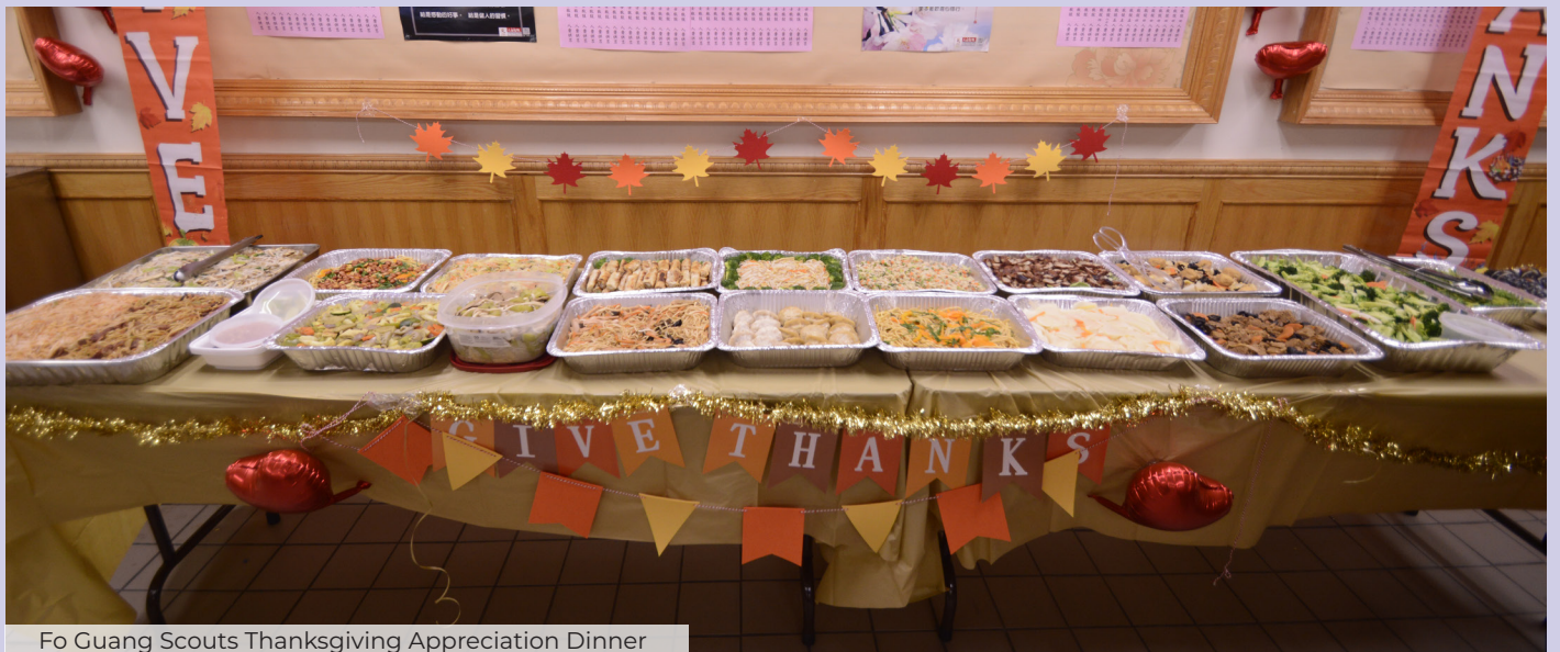
Fo Guang Scouts Thanksgiving Appreciation Dinner