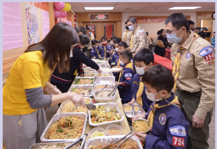
Fo Guang Scouts join for a Thanksgiving celebration