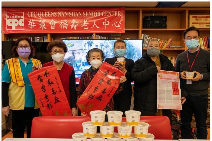
Distributing Laba Porridge to the Nan Shan Senior Center