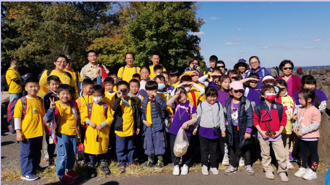
Hiking and Cleaning Up Palisades Interstate Park