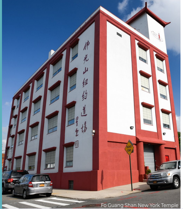
Fo Guang Shan New York Temple

To celebrate the season of giving, BLIA hosted many events to give back to the community, including a local playground cleanup and community toy drive. The New York Chapter also delivered Thanksgiving Appreciation Baskets to our neighborhood leaders and Laba Porridge to community members. To wrap up 2022, the New York Fo Guang Scouts were also busy preparing for their homemade Thanksgiving dinner and "Three Acts of Goodness" class.