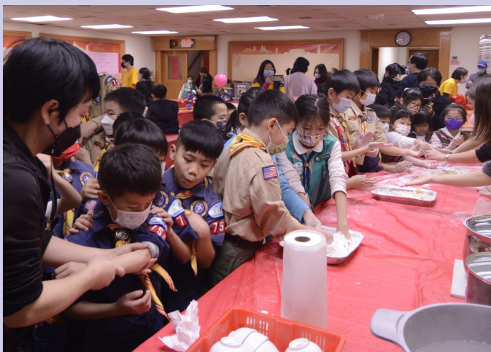
Fo Guang Scouts working hard to prepare for Thanksgiving dinner