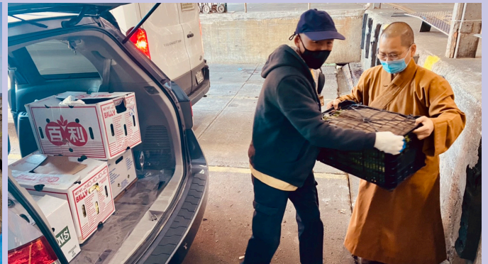
Donating fresh vegetables to senior citizens in need