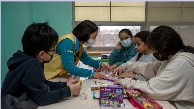
Wrapping toys with students from PS22