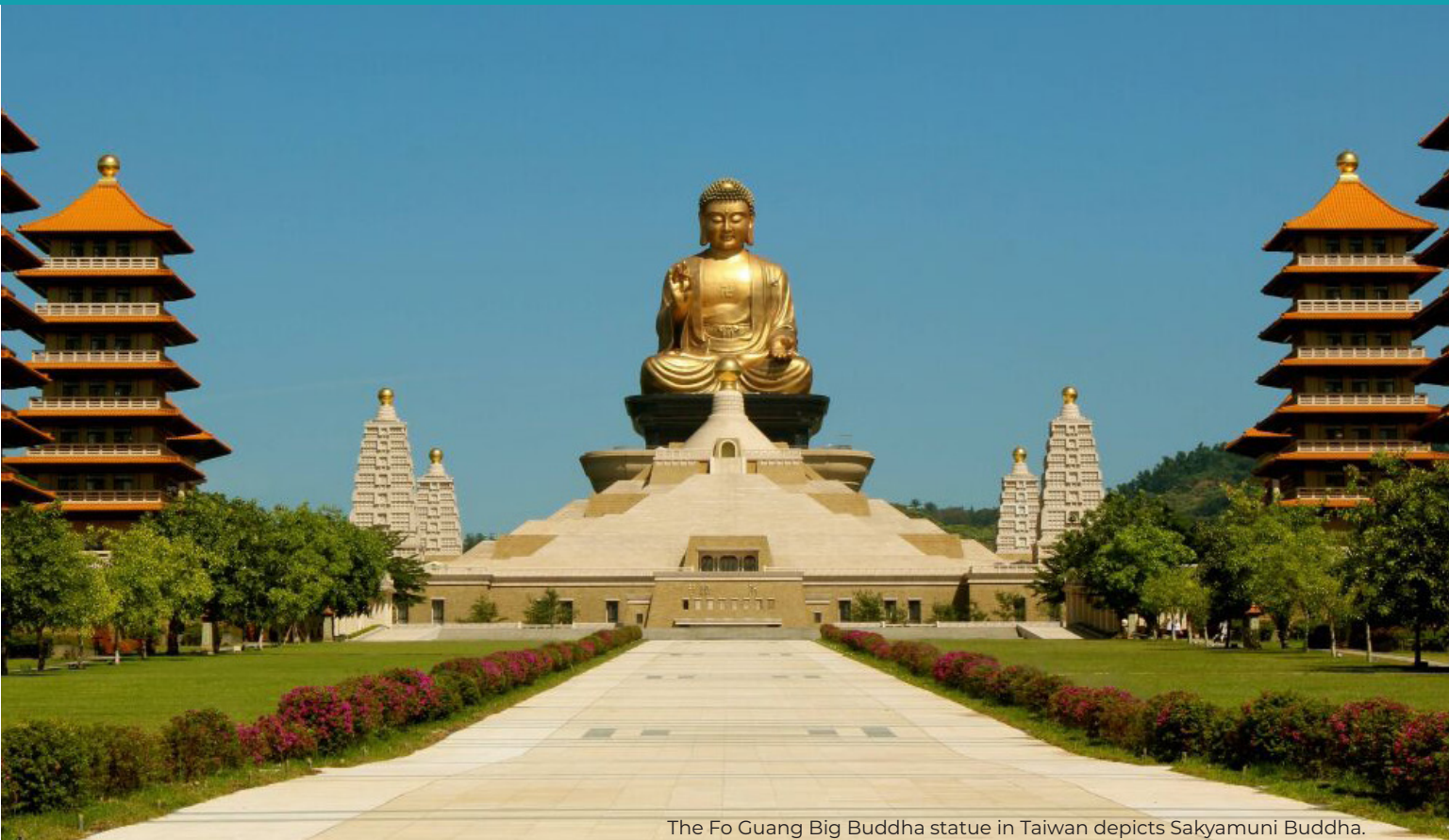
The Fo Guang Big Buddha statue in Taiwan depicts Sakyamuni Buddha.