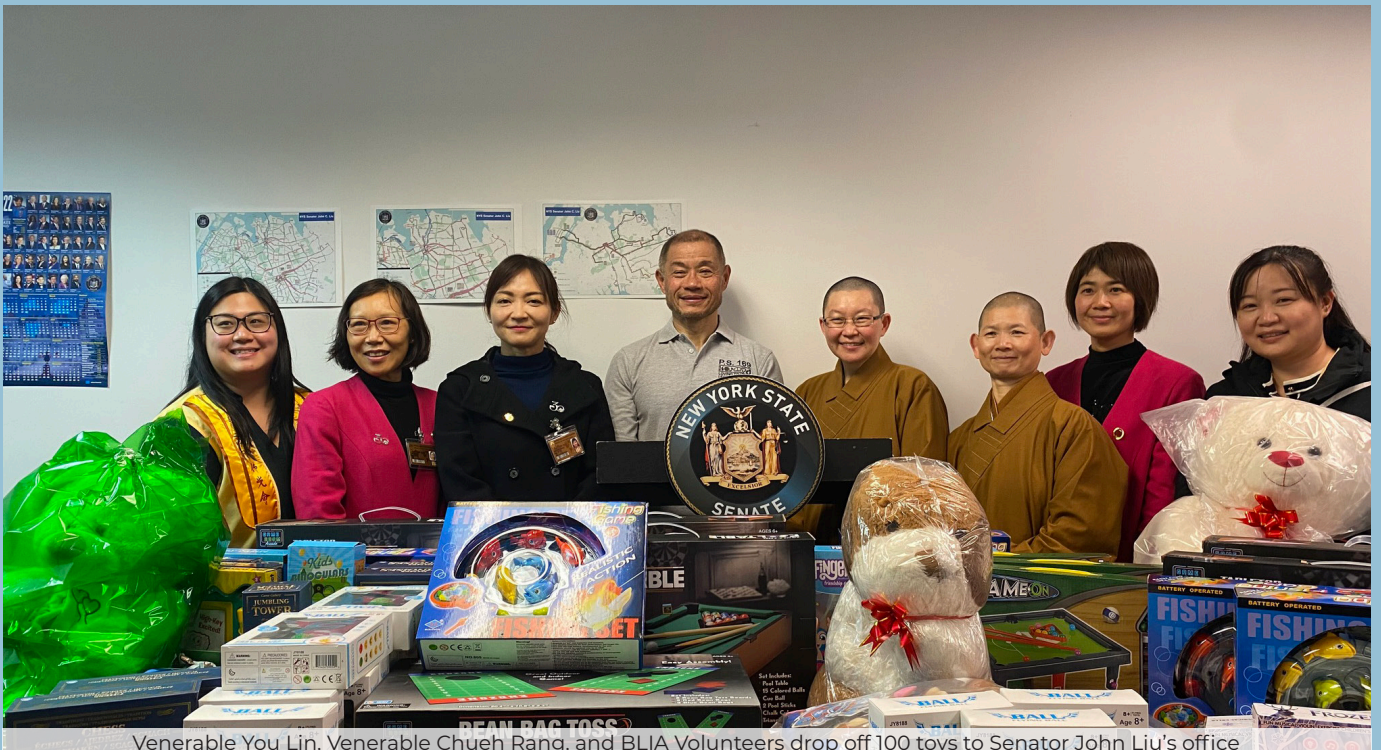
Venerable You Lin, Venerable Chueh Rang, and BLIA Volunteers drop off 100 toys to Senator John Liu's office