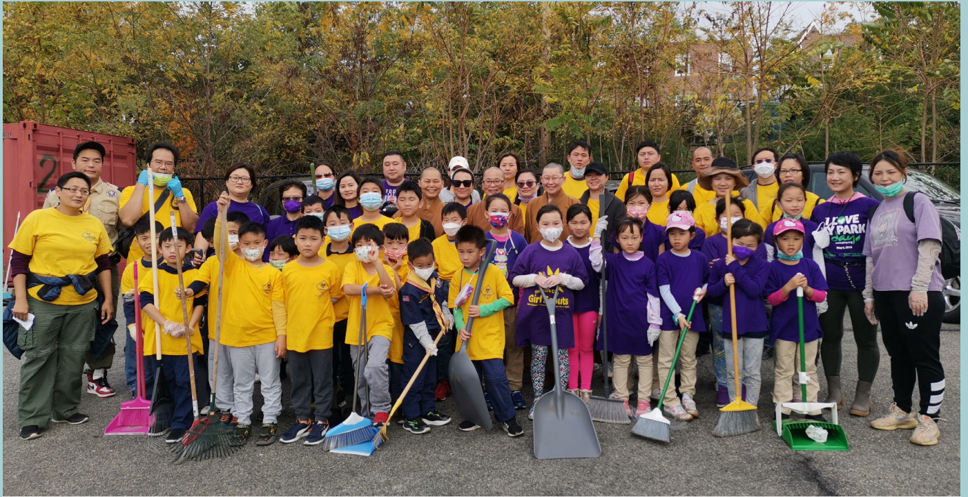
Fo Guang Cub Scouts preparing for the park clean up at Murray Hill Playground

On the morning of November 6th, the New York Fo Guang Cub Scouts organized a park clean up at Murray Hill Playground, located one block from Fo Guang Shan New York Temple. Over 50 people, including Scouts and their parents, gathered in the parking lot of the temple to recite the Cub Scout Oath and Promise. The clean up began on the streets outside the temple and continued to Murray Hill Playground. The children used rakes, shovels, brooms, and dustpans to collect litter and leaves. After 2 ½ hours of hard work and over 50 garbage bags collected, the park clean up was a success. Many residents and parkgoers expressed their gratitude towards the Scouts for their efforts.