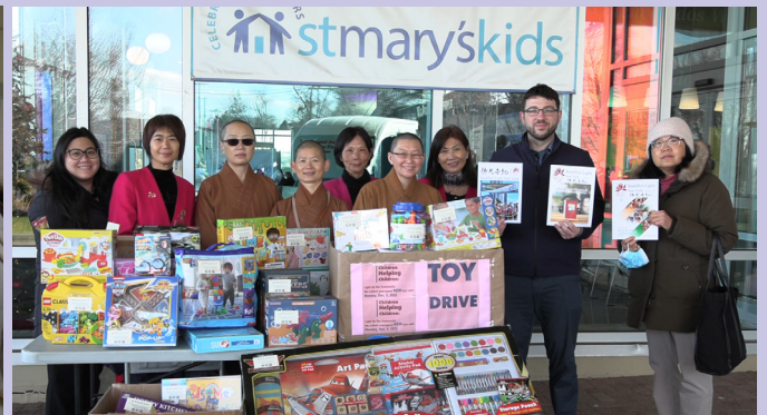
Delivering toys to St. Mary's Hospital for Children