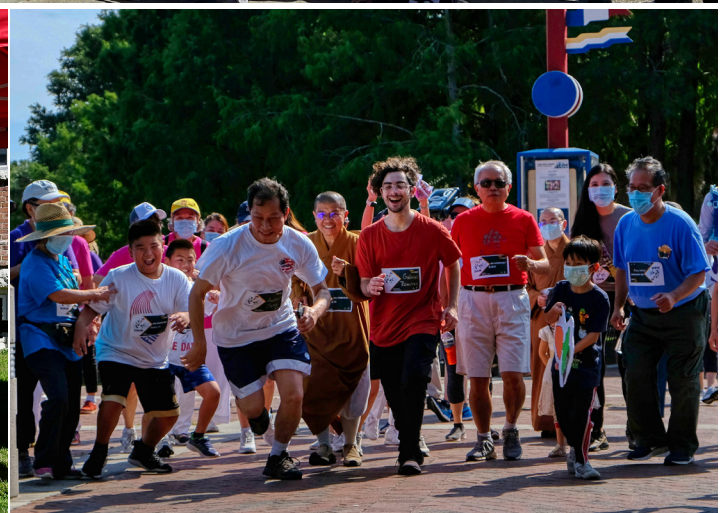
Ready, Set, Go! BLIA's Florida Chapter participated in VegRun