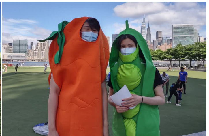
VegRun Mascots BoBo and DouDou