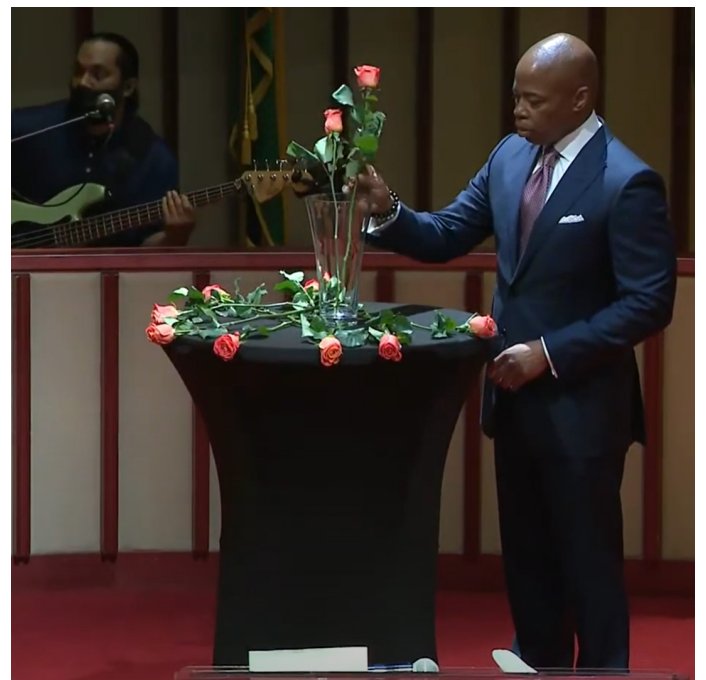
Mayor Eric Adams paying respect the lives lost