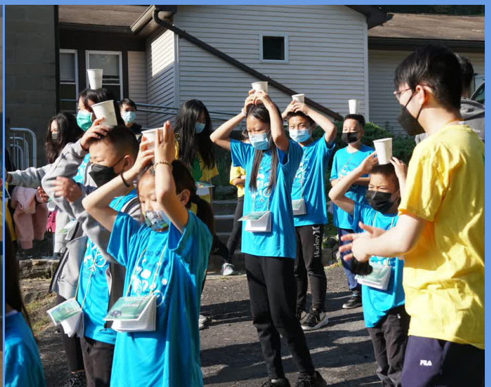
Campers participated in various outdoor activities