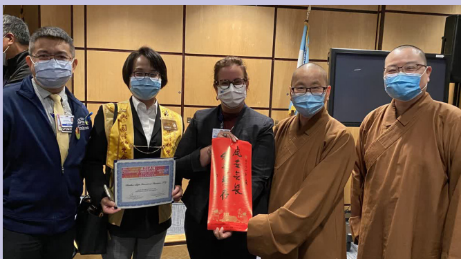
Award recipient at Elmhurst Hospital's AAPI Heritage Celebration