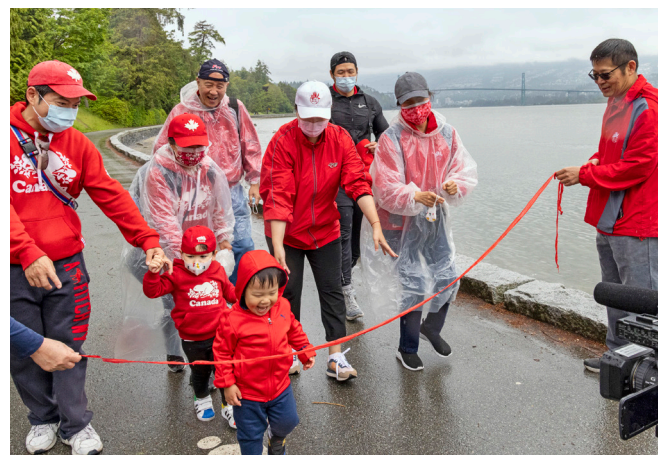
People of all ages joined in the fun by BLIA's Ottawa Chapter