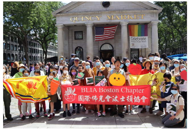
BLIA's Boston Chapter at Quincy Market