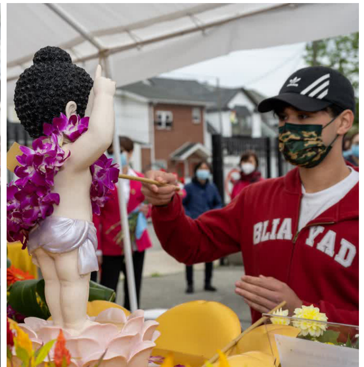
Community members were welcome to bathe the Buddha