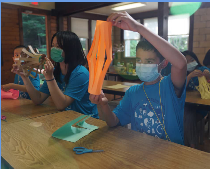
Arts & crafts: paper lanterns