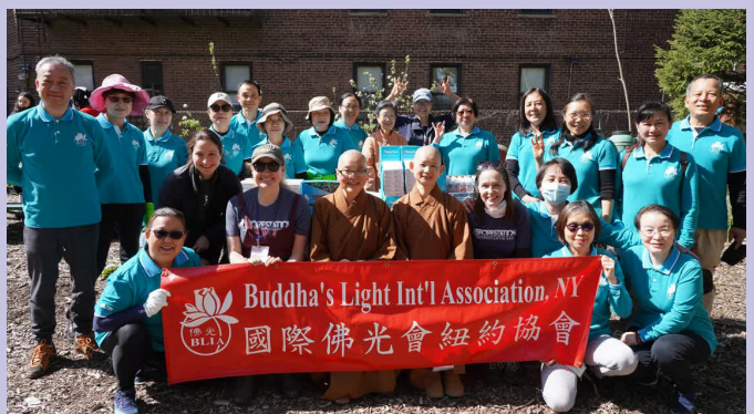
Volunteering at Moore Jackson Community Garden