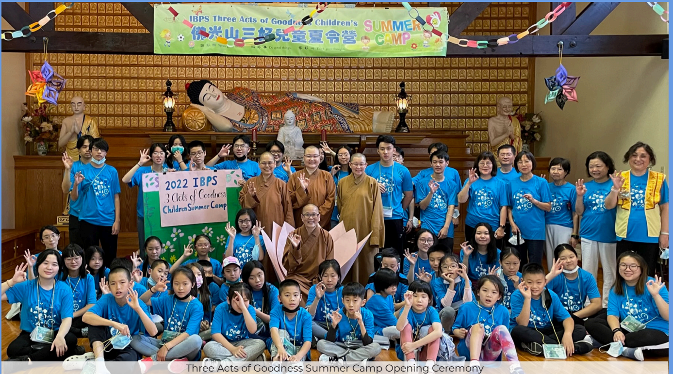
Three Acts of Goodness Summer Camp Opening Ceremony

On June 30, the 2022 Three Acts of Goodness Children's Summer Camp kicked off its opening ceremony at the Fo Guang Shan Deer Park Retreat Center. The summer camp welcomed 30 children to connect with nature, practice the Three Acts of Goodness (Do Good Deeds, Speak Good Words, and Think Good Thoughts), and explore this year's theme of acceptance and growth.