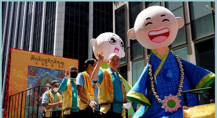
BLIA's Float in the AAPI Cultural and Heritage Parade in New York City

Fo Guang Shan New York Temple also participated with a float and presented the Buddhist "Three Good" figures who speak good words, think good thoughts, and do good deeds. The Fo Guang Shan community and Buddha's Light New York Chapter enthusiastically came together to teach and present Buddhist concepts to the public.