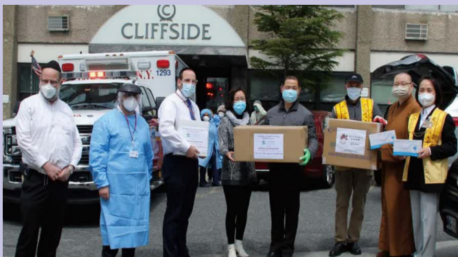
Donating masks to Cliffside Health Care Center