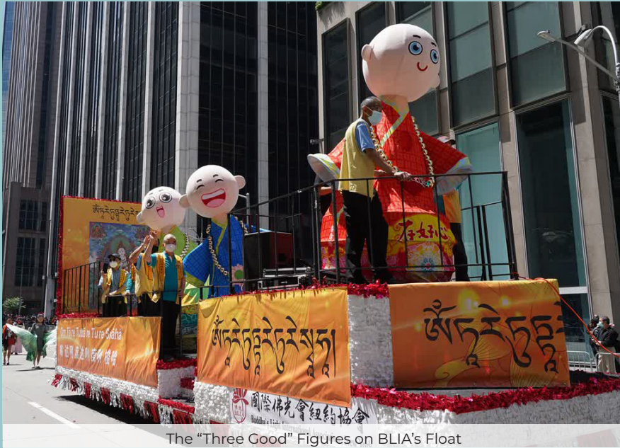
The "Three Good" Figures on BLIA's Float

New York City's first-ever Asian American and Pacific Islander (AAPI) Cultural and Heritage Parade was held on May 15, 2022.