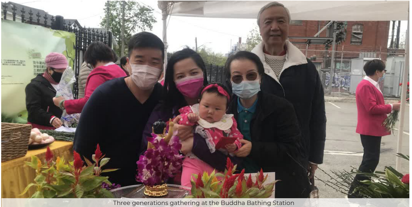
Three generations gathering at the Buddha Bathing Station

On May 8th, Fo Guang Shan New York Temple celebrated the Buddha's Birthday with an online Dharma Service and an outdoor Buddha Bathing Ceremony. Over 300 members and their families showed up to the Buddha-bathing pavilion in person. When bathing the Buddha, one should pray for peace, harmony, and elimination of violence and evil in the world. The benefits of bathing the Buddha include happiness, good health, longevity, wealth, and peace for family and friends. As the COVID-19 pandemic continues, the community was encouraged to seek purification and blessings from the Buddha to eliminate suffering and conflicts and to usher in a peaceful and bright future.