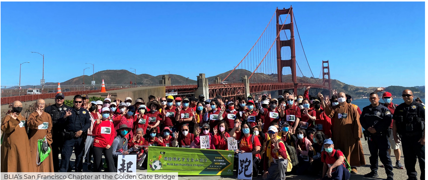
BLIA's San Francisco Chapter at the Golden Gate Bridge