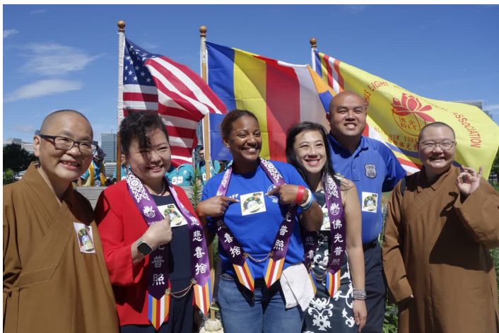
Special Guests at the VegRun Opening Ceremony