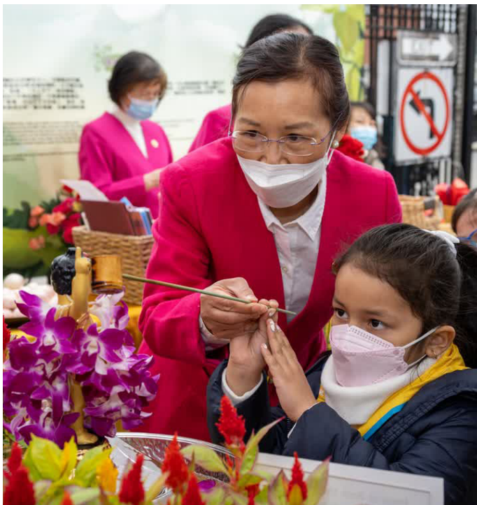
FGS volunteer helping a Cub Scout bathe the Buddha

On May 8th, Fo Guang Shan New York Temple celebrated the Buddha's Birthday with an online Dharma Service and an outdoor Buddha Bathing Ceremony. Over 300 members and their families showed up to the Buddha-bathing pavilion in person. When bathing the Buddha, one should pray for peace, harmony, and elimination of violence and evil in the world. The benefits of bathing the Buddha include happiness, good health, longevity, wealth, and peace for family and friends. As the COVID-19 pandemic continues, the community was encouraged to seek purification and blessings from the Buddha to eliminate suffering and conflicts and to usher in a peaceful and bright future.