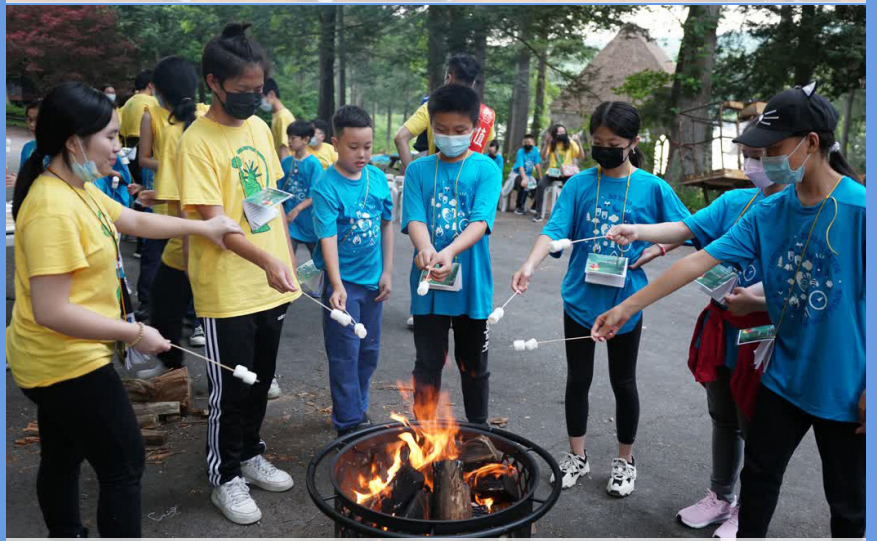
Campers and counselors took turns roasting marshmallows