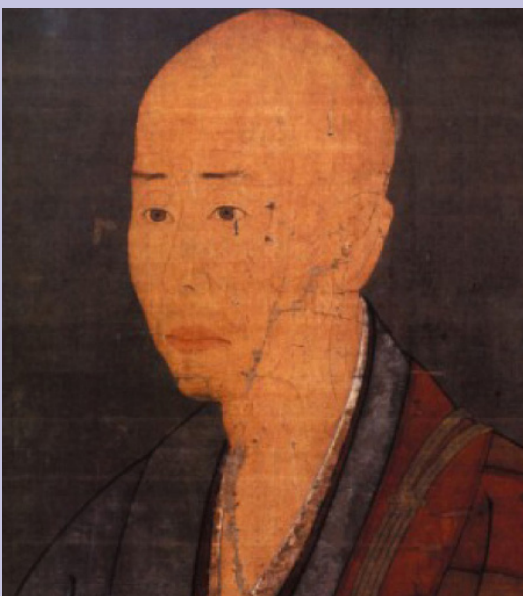
Chan Master Wumen Huikai

Venerable Master Hsing Yun said, “If we practice Humanistic Buddhism, or in other words, apply the Buddhist teachings to our everyday living, then we possess the entire universe, happy and at peace in all we do.”