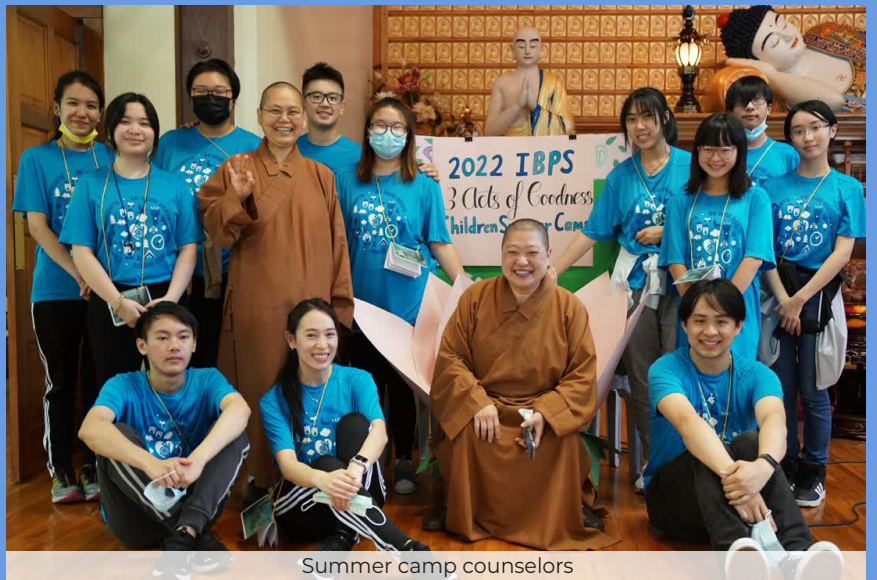
Summer camp counselors