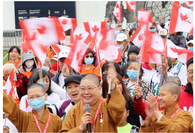
BLIA's Ottawa Chapter welcomed all Canadians to race