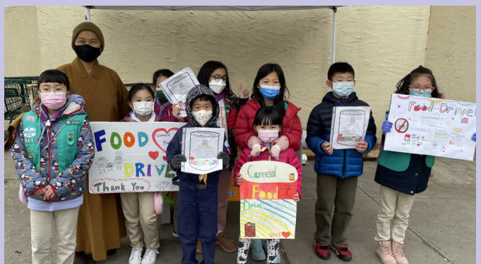
BLIA Scouts hosting a food drive