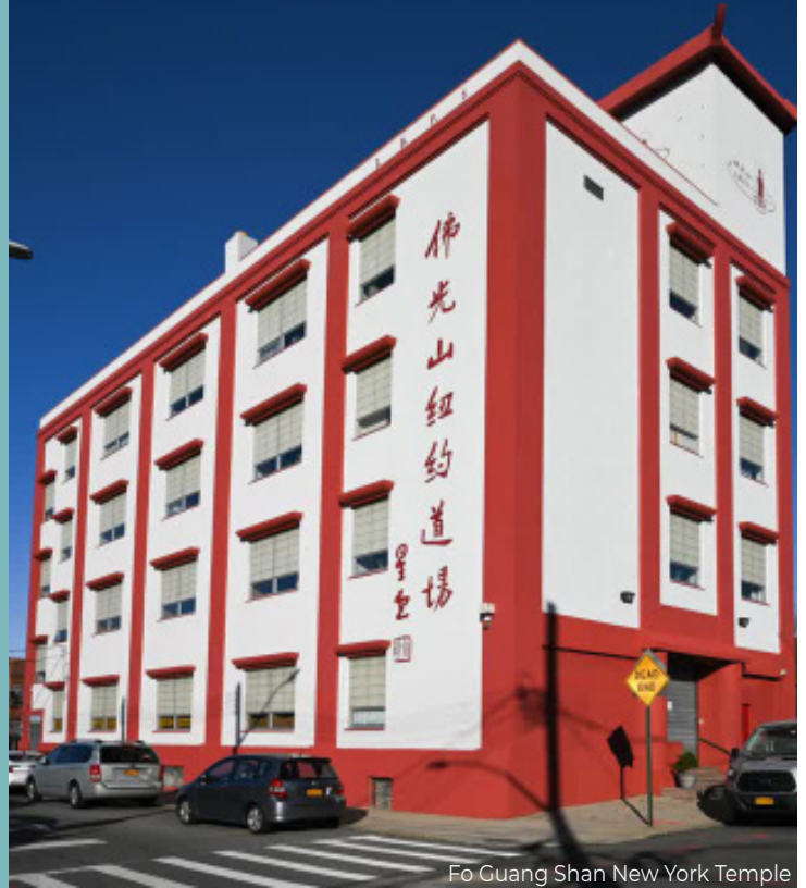
Fo Guang Shan New York Temple

To promote interfaith collaboration, BLIA has also participated in the Interfaith Civic Leadership Academy Graduation and the Interfaith Prayer Vigil for the victims of the May 14th Buffalo, NY shooting.