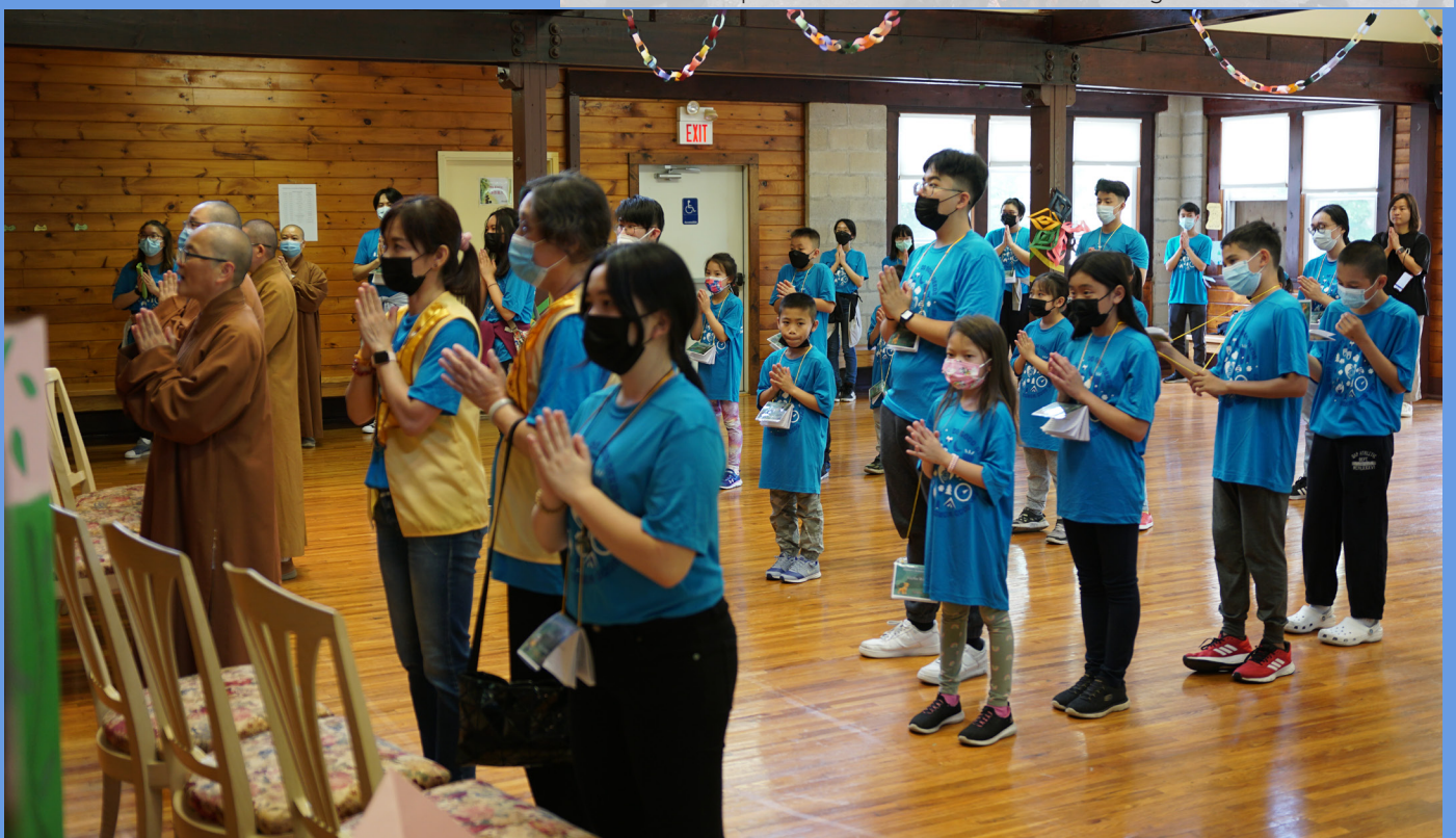
Three Acts of Goodness Children's Summer Camp Prayer Service