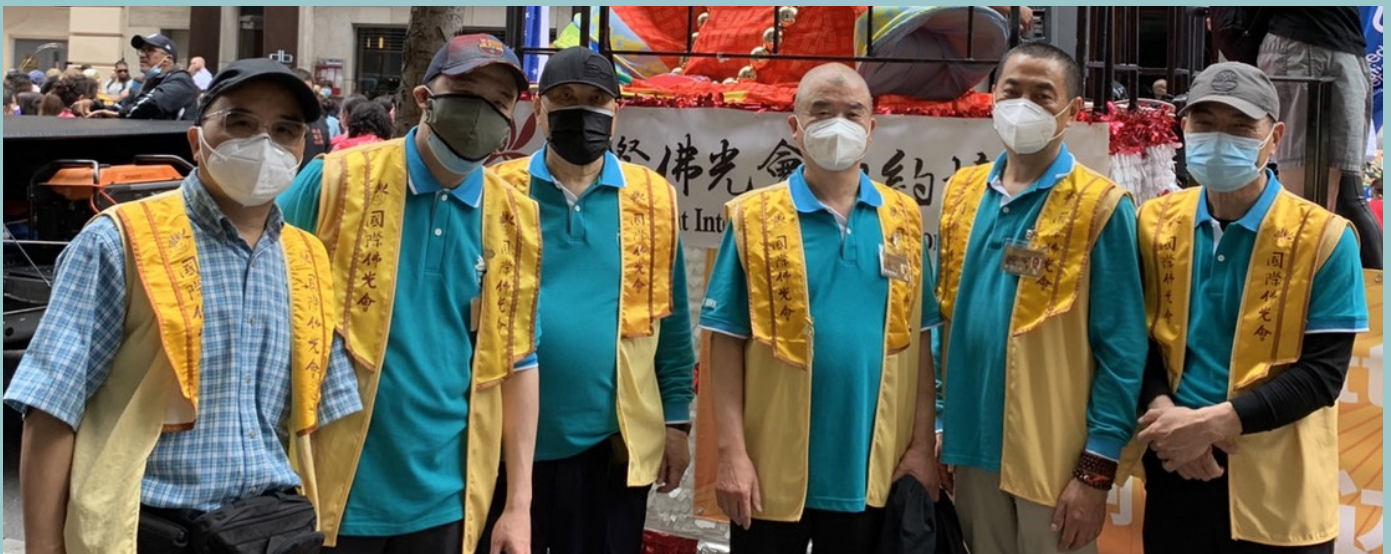
BLIA volunteers preparing to march in the parade